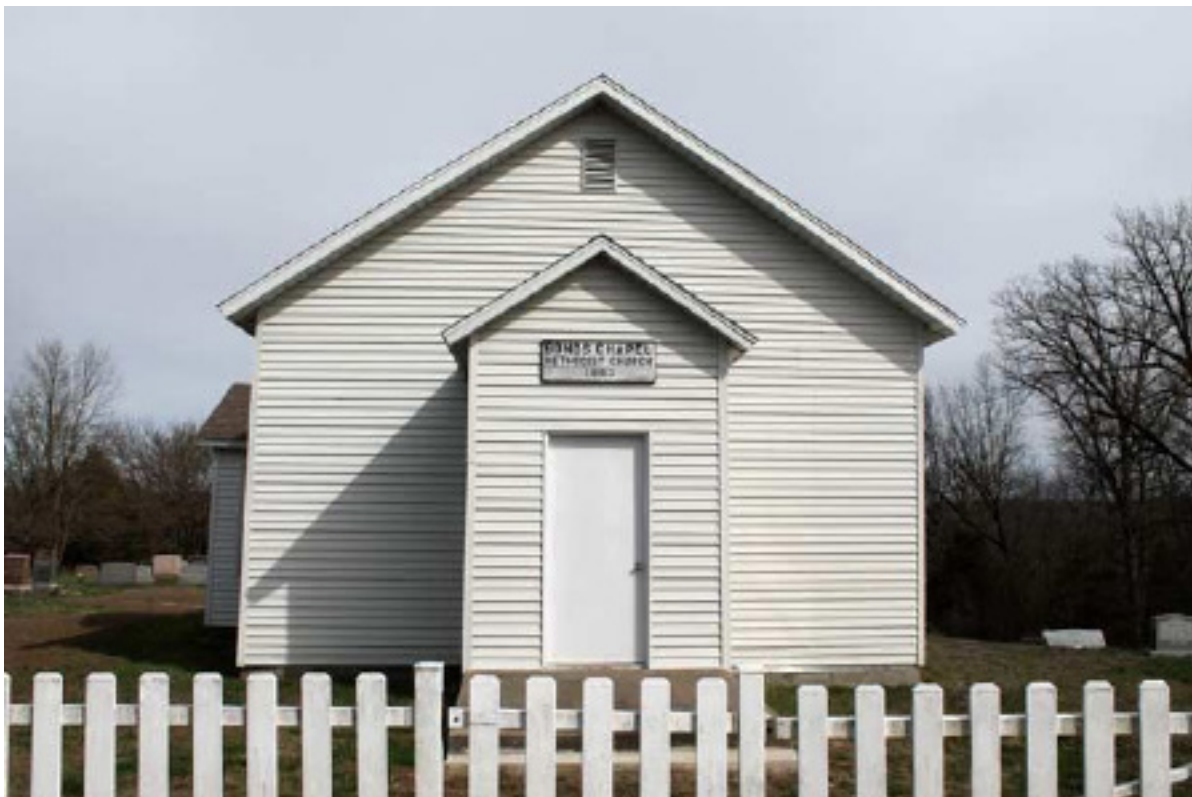
Fig. 10 Bond's Chapel Methodist, Boone County.

Nebo Baptist, it is striking that the congregation met in a log structure for such a long time before building a brick church. Ewing, shortly after he moved to Missouri, built log houses for his family very near the log church. Ewing considered these log houses temporary lodgings while he built a large, multi-story brick home. 60 The log church, however, was different. Rather than being replaced like Ewing's log houses, it was used for forty years despite the fact that its pastor (and probably some of its members) had the knowledge and ability to build larger, more complex, and more permanent structures. This suggests that something other than material and technological limitations were behind the simplicity of their church. When the Cumberland Presbyterians of New Lebanon did replace their log church with a brick one, they increased the size by 960 square feet and added a bell, but the core design remained the same. The church is constructed from bricks fired on site. 61 The red brick church did not have identical aesthetic qualities to the log one, but the change from log to brick simplified maintenance while still preserving the basic aesthetic forms necessary to provide the "shared experience" that Mathews claims organized the new nation. In other words, to almost every other Missouri Protestant, the experience of worshipping in a one room, gable-end, brick or frame church was not categorically different from worshipping in a log church.