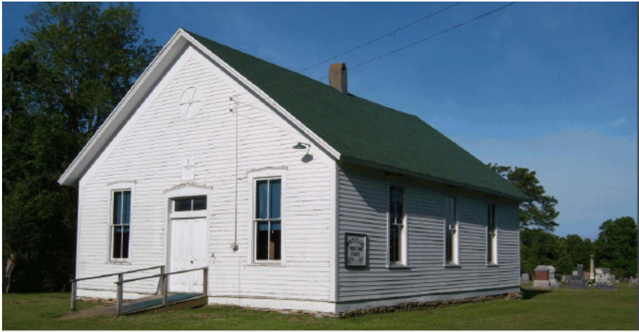
Fig. 1 White Cloud Presbyterian Church, Callaway County, Missouri

Let all preaching-houses be built plain and decent; but not more expensive than is absolutely unavoidable; otherwise the necessity of raising money will make rich men necessary to us.