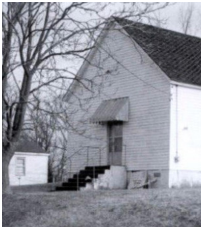
Oakley Chapel AME