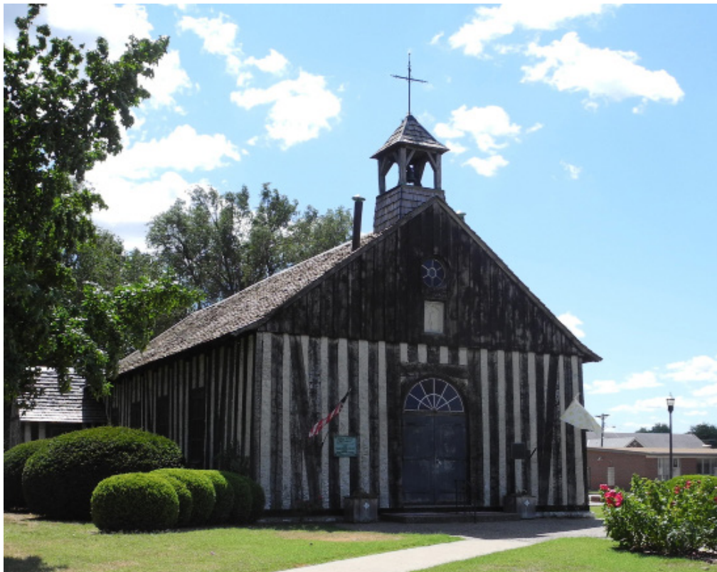
Fig. 12 Church of Holy Family. Saint Clair County, Illinois.