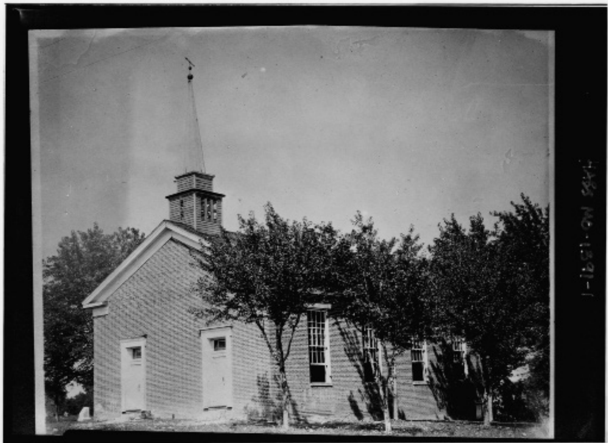
Fig. 2 New Lebanon Cumberland Presbyterian Church, Cooper County.