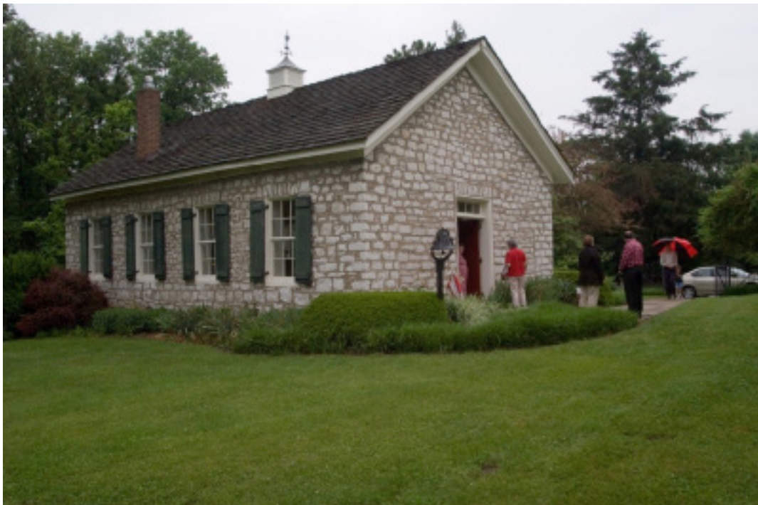
Fig. 8 Des Peres Presbyterian, St. Louis County.