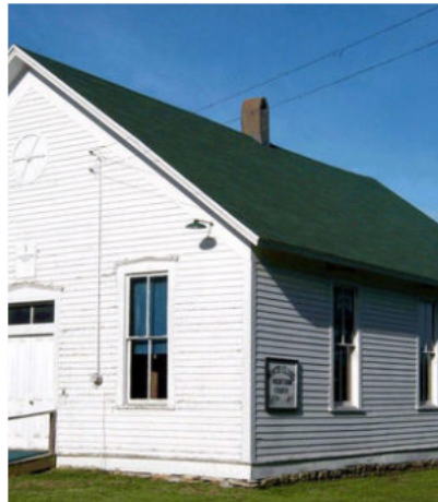
White Cloud Presbyterian Church