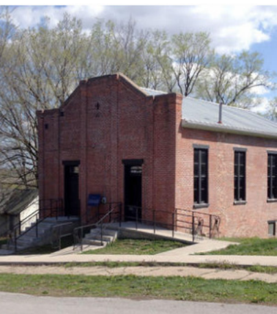
Campbell Chapel AME