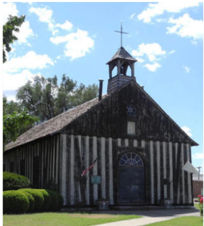
Church of Holy Family