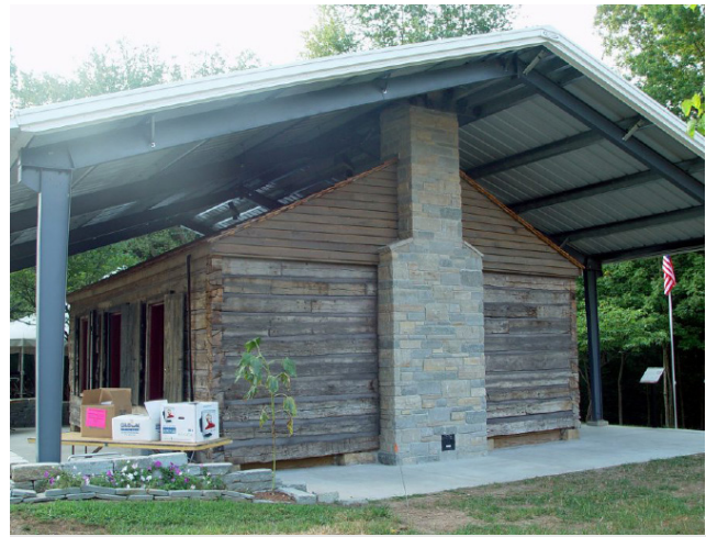
Figure 4: Reconstruction of the Second Old Bethel Church, Cape Girardeau County.

church was organized, and soon afterward a house was built, in which they met to worship God. This was the first house of worship built by anti-Catholics, west of the Mississippi River. From the great river to the Pacific Ocean this log house was the only building devoted to the service of the living God. 31 (See Fig. 3-4)