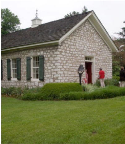
Des Peres Presbyterian