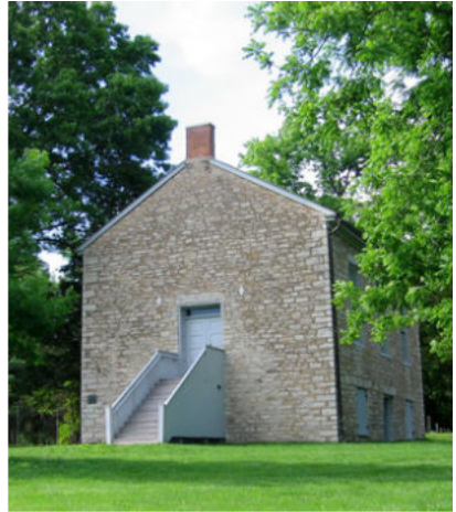
Bonhomme Presbyterian Church ("Old Stone Church")