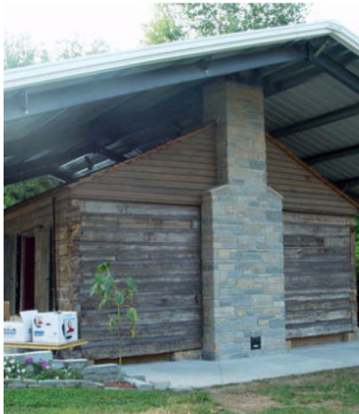
Reconstruction of the Second Old Bethel Church, Cape Girardeau County