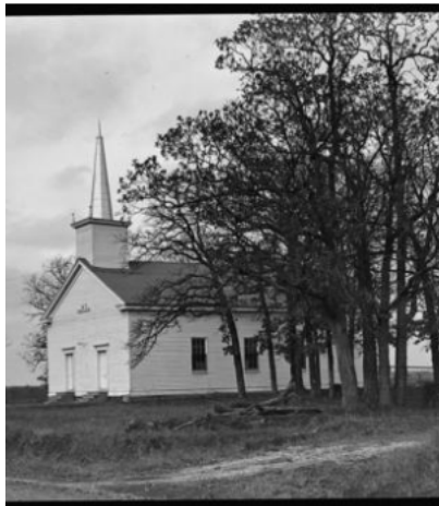
Mount Nebo Baptist Church