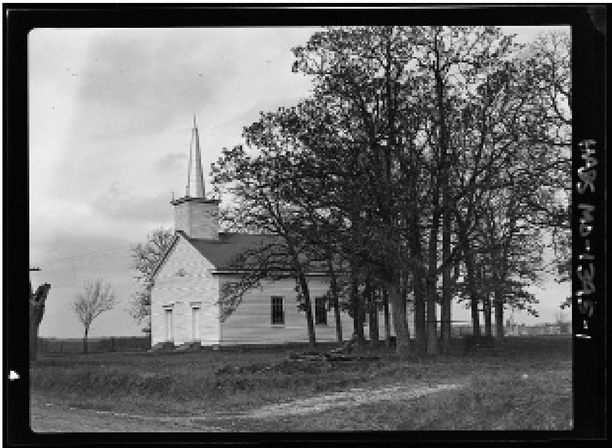
Fig. 9 Mount Nebo Baptist Church, Pleasant Green, MO., Cooper County. Library of Congress, Prints & Photographs Division, HABS MO-1395.

Not far from Mount Nebo Baptist church is another gable-end church from the 1850s, New Lebanon Cumberland Presbyterian—Ewing’s church with which I began this paper. 55 Of the churches I examined, it has the most obvious and direct ties to what is conventionally considered the Second Great Awakening. New Lebanon began as the “New Lebanon Society” composed of settlers originally from Lebanon, Tennessee who established themselves in Cooper County, Missouri. These settlers were members of the original Lebanon Church in Tennessee, where Ewing had been pastor. 56 According to the NRHP registration documents, so many of Ewing’s Tennessee congregants moved to Missouri that he decided to join them in 1820. Initially, the New Lebanon Cumberland Presbyterians held meetings outdoors or met in a log double-house on a piece of Ewing’s land set aside for camp meetings. The log building was torn down in 1859 to build the extant New Lebanon Cumberland Presbyterian Church. 57