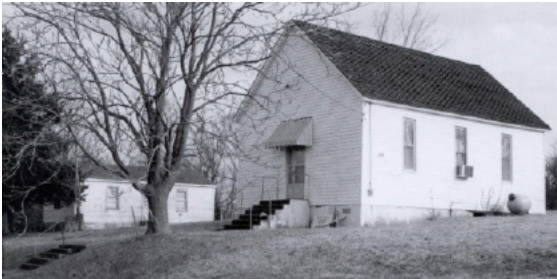
Fig. 14 Oakley Chapel AME, Callaway County.