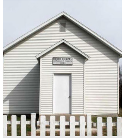
Bond's Chapel Methodist