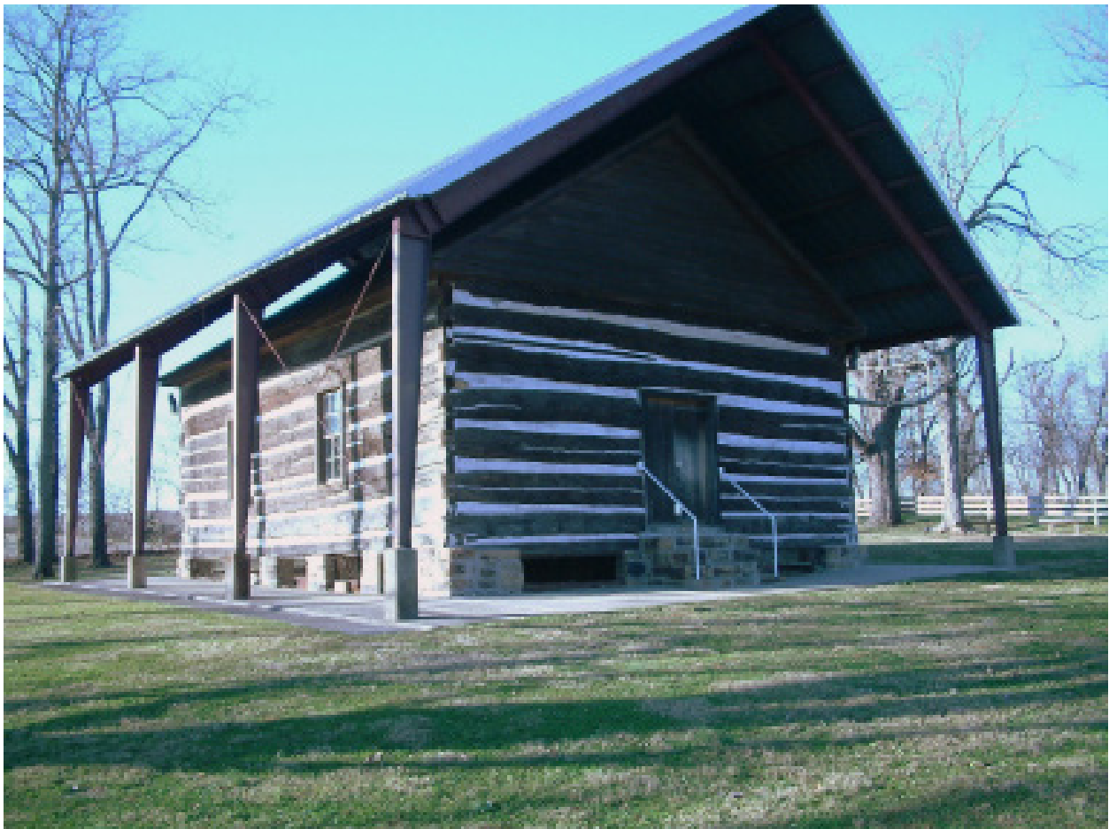
Fig. 5 Exterior of McKendree Chapel, Cape Girardeau County.