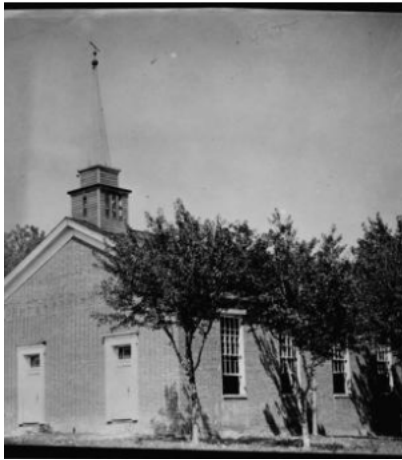
New Lebanon Cumberland Presbyterian