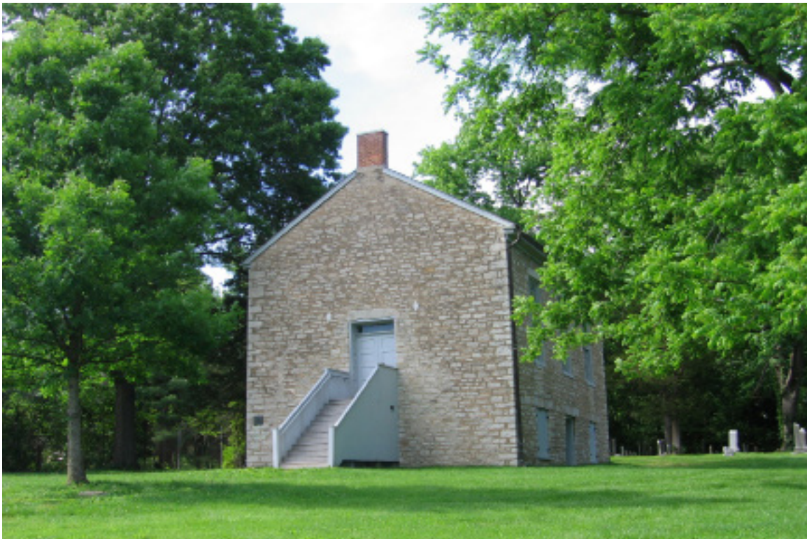
Fig. 7 Bonhomme Presbyterian Church, “Old Stone Church,” St. Louis County.