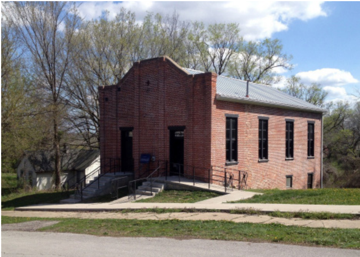
Fig. 13 Campbell Chapel AME, Howard County. Fair Use. Photographer unknown.