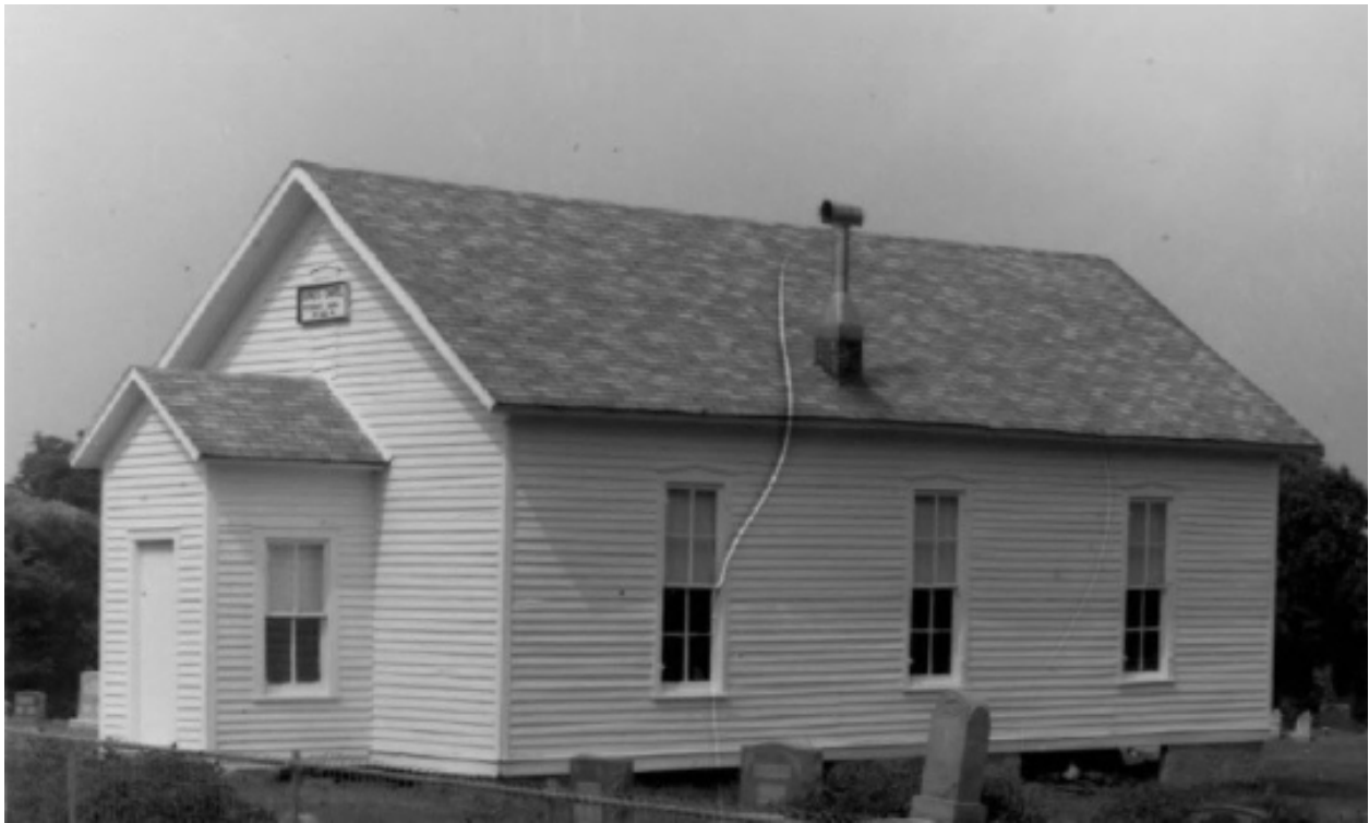
Fig. 11 Bond's Chapel Methodist, Boone County.

The last gable-end church we will examine, is, not surprisingly, very similar to the prior churches considered, but it also has a significant difference. Built at the late date of 1883, Bond's Chapel Methodist Church in Boone County, Missouri was the first and only structure used by the Bond's Chapel congregation (Figs. 10-11). 62 The building is a wood frame, twenty-four by forty-three-foot rectangle with a small chancel projecting from the north wall. 63 It has a double-door entrance inside a vestibule, which was added in the 1940s to protect the old original doors. 64 Unlike many other small churches built at the end of the nineteenth century, the building was not built from a partially assembled, mail-order kit, but was constructed from lumber milled by the builders, who were also the church's founders. 65 Of all the Registration Documents surveyed for this paper, the one prepared for this church was the only to suggest that the "primitive" design was informed by social and theological dictates rather than poverty or haste. The preparer of these forms, Dr. Bonnie Stepenoff, connects Bond's chapel directly to McKendree. She writes: