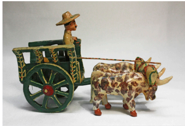
Fig. 24 Elizabeth Gálvez de Varela, Clay figure from the Central valley of Chile , early twentieth century, painted clay, 7.8 x 6.7 x 9 in. (20 x 17 x 23 cm). Museo Histórico Nacional, Santiago de Chile.

28 Harpists also appear in both ceramics and paintings. Harpists, usually from the countryside, are typical of Chilean history, since the harp is one of the most representative instruments of Chilean musical tradition. 30 Originating among the bourgeois, during the nineteenth century the harp became the central instrument at fondas and chinganas —two kinds of popular celebrations involving dance, alcohol, and music. Harpists also play at rural festivals marking the agrarian cycle and at Christmas parties. In the central region of Chile, the harpist is consistently linked in iconography to the figure of a singer. 31 As evidence of the importance of these popular types in the Chilean social imaginary of the period, ceramic figurines of singers and harpists made at the beginning of the twentieth century survive to this day and early-twentieth-century photographs show such figurines for sale on La Alameda. Photographs from the beginning of the twentieth century show harpists at popular fondas ; caricatures from the time draw on familiar Christmas imagery to make social critiques.