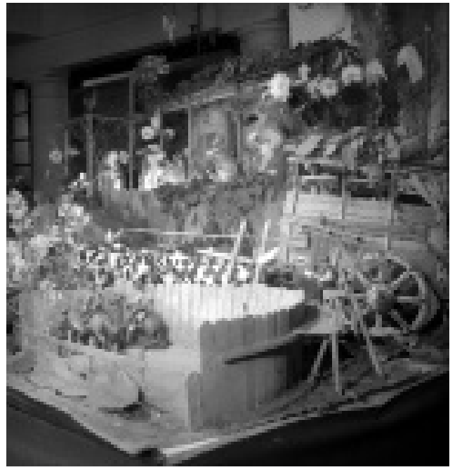
Fig. 8 Popular Chilean Nativity Creche, Santiago de Chile , early twentieth century, photograph.

interpreting the birth of Jesus. In developing different performances with and around nativity scenes, the creators of these objects and those who interacted with the completed assemblages developed a unique way of partaking in the Christian celebration. Materiality is inherent to human experience and part of its context; it is therefore a fundamental aspect in the production of culture. In this sense, the material and the intellectual/spiritual are not opposing forces, but rather part of a continuous space of reception and production where both aspects are important. 15 In this essay, understanding these ideas offers the possibility of implementing a methodology that looks for commonality among religion, social reality, literature, and forms of visual representation.