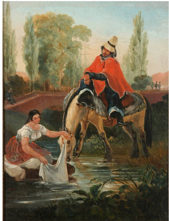
Fig. 18 Johann Moritz Rugendas (Juan Mauricio Rugendas), El huaso y la lavandera ( The Huaso and the Washerwoman ), ca. 1835, oil on canvas, 11.8 x 9 in. (30 x 23 cm), 1835. Museo Nacional de Bellas Artes, Santiago de Chile.

26 One example is German painter Johann Moritz Rugendas, who depicted many characters and themes related to Chilean identity over the course of his prolific career as a visual artist. 27 Popular Chilean figures, particularly the huaso, appear frequently in his work. Rugendas came to South America to capture typical landscape scenes and popular characters and customs of the newly-formed Latin American republics. Like many artists of his time, Rugendas initially came to South America as part of a scientific expedition. He accompanied Baron George Heinrich von Langdorf to Brazil and then proceeded to travel solo throughout South America, depicting its geography and characters. He liked Chile so much that he spent many years traversing the territory and working on prints, drawings, and canvases depicting its