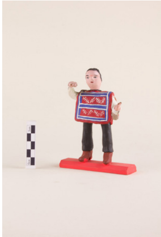
Fig. 10 Huaso Figurine from the Central Valley of Chile , early twentieth century, painted clay, height: approx. 4 in. (10 cm). Villa Cultural Huilquilemu, Huilquilemu, Chile.