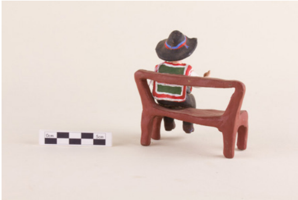
Fig. 11 Figurine from the Central Valley of Chile of a Huaso Seated on a Bench , early twentieth century, painted clay, approx. 4 x 4 in. (10 x 10 cm). Villa Cultural Huilquilemu, Huilquilemu, Chile.

traditional and rural life of the century before, they used the huaso as a tool for depicting that lost world. These groups were searching for their own version of authenticity, which was seen related with the rural world, its artefacts, its characters and traditions.