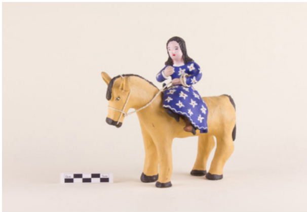
Fig. 23 Figurine from the Central Valley of Chile of a Young Woman Riding a Horse , early twentieth century, painted clay, approx. 6 x 4 in. (15 x 10 cm). Villa Cultural Huilquilemu, Huilquilemu, Chile.