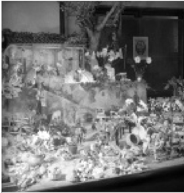
Fig. 6 Popular Chilean Nativity Creche, Santiago de Chile , early twentieth century, photograph.

the background a pair of oxen and a farmer are crossing a bridge made of little sticks; cardboard is used to make a mountain, a form popular in other Chilean visual and literary representations as a way of situating the Nativity within Chile's rugged terrain (Fig 5, see Figs. 6-8 for details of this and other similar crèches). A rural imaginary prevails in this composition. This does not mean that agrarian and urban settings should be studied as oppositional phenomena, quite the contrary; they come across visually as complementary ways of inhabiting the world. I will focus on the rural not as a mere stepping-stone to the urban, but rather as a dynamic way of life capable of ascribing meaning and living in tandem with other realities.