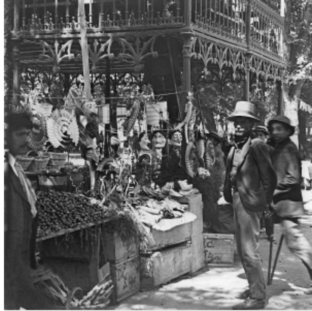
Fig. 15 Vendors on the Boulevard of La Alameda , ca. 1906, stereoscopic positive plate, gelatin.