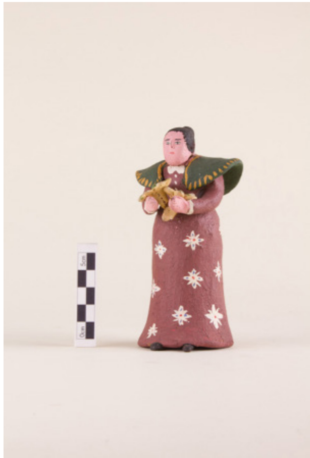
Fig. 25 Figurine from the Central Valley of Chile of an Elegant Woman , early twentieth century, painted clay, approx. 4 x 2 in. (10 x 5 cm). Villa Cultural Huilquilemu, Huilquilemu, Chile.

29 Singers and harpists also appear together in Arturo Gordon's paintings and, later, in