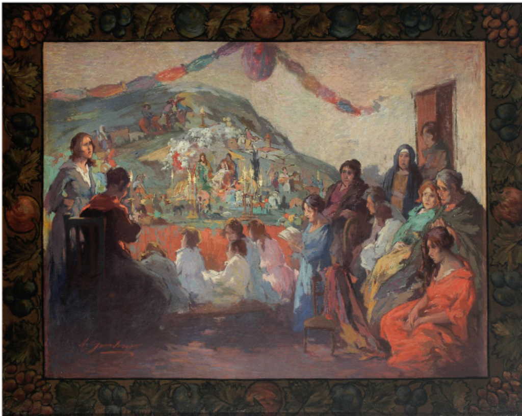
Fig. 13 Arturo Gordon, Novena del Niño Jesús ( Novena of the Christ Child ), early twentieth century, oil on canvas, 46 x 37 in. (117 x 94 cm). Museo Nacional de Bellas Artes, Santiago de Chile.