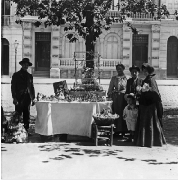
Fig. 14 Vendors on the Boulevard of La Alameda , ca. 1906, stereoscopic positive plate, gelatin.

entire city from west to east and was used for public promenades and festivities, such as Christmas markets. Some of these stands sold flowers, fruits, other comestibles, and clay figurines depicting popular characters (Fig. 14-15).