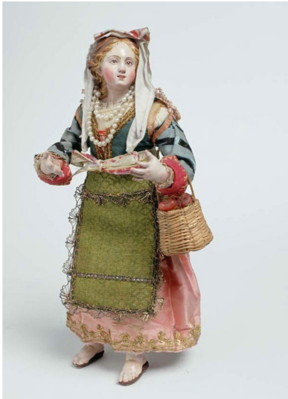
Fig. 1 Peasant with a Fruit Basket from a Neapolitan Nativity Creche , second half of the eighteenth century, wire-frame figure lined with burlap that connects the extremities, carved in wood or in baked clay, height: 11 in. (28 cm). Museo de Historia, Madrid.