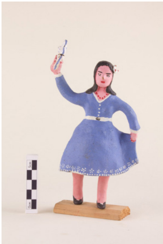
Fig. 20 Figurine from the Central Valley of Chile of a Woman Dancing with Something in her Hand , early twentieth century, painted clay, approx. 5 x 2 in. (13 x 5 cm). Villa Cultural Huilquilemu, Huilquilemu, Chile.