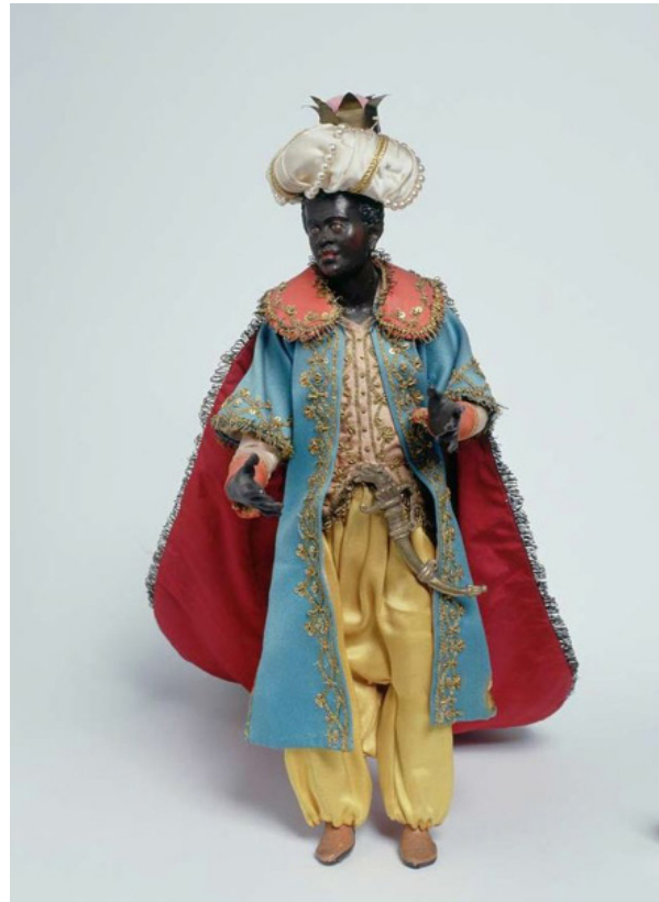
Fig. 2 Baltazar Figure from a Neapolitan Nativity Creche , second half of the eighteenth century, wire-frame figure lined with burlap that connects the extremities, carved in wood or in baked clay, height: 13.8 in. (35 cm). Museo de Historia, Madrid.