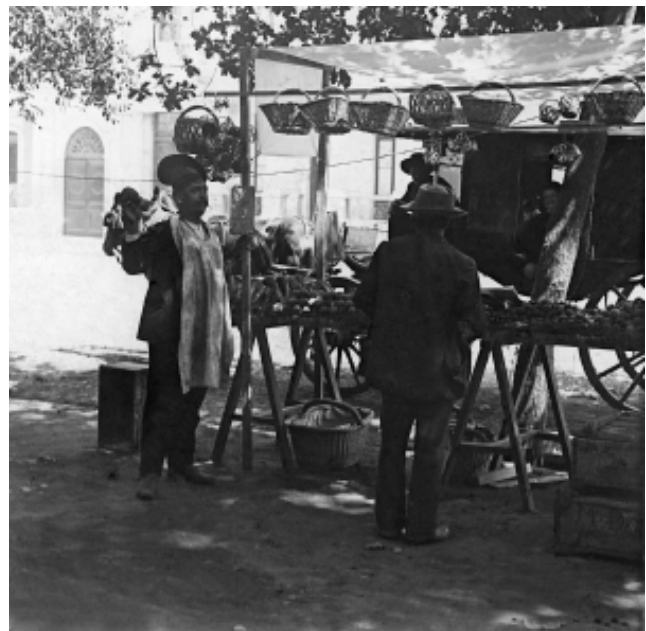
Fig. 17 Vendors on the Boulevard of La Alameda , ca. 1906, stereoscopic positive plate, gelatin.