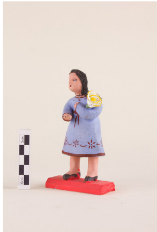
Fig. 21 Figurine from the Central Valley of Chile of a Woman Carrying a Bunch of Flowers , early twentieth century, painted clay, approx. 4 x 2 in. (10 x 5 cm). Villa Cultural Huilquilemu, Huilquilemu, Chile.