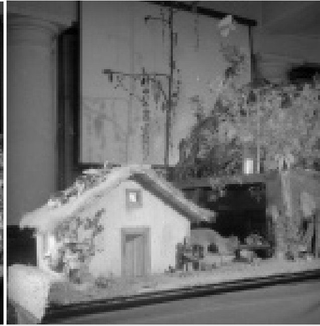
Fig. 7 Popular Chilean Nativity Creche, Santiago de Chile , early twentieth century, photograph.