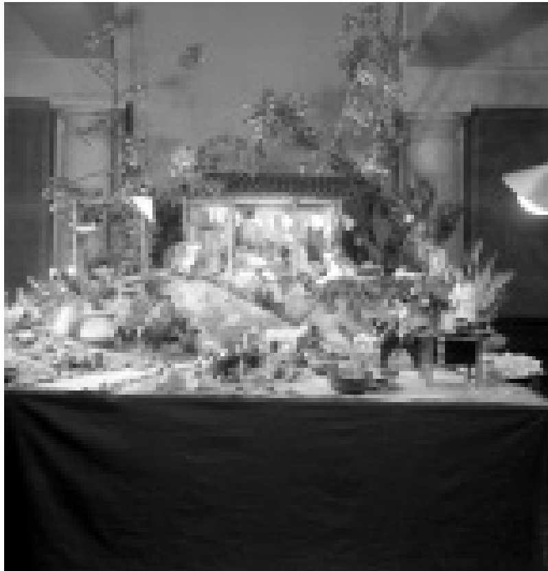
Fig. 5 Popular Chilean Nativity Creche , Santiago de Chile, early twentieth century, photograph. Archivo Fotográfico Universidad de Chile, Santiago de Chile.