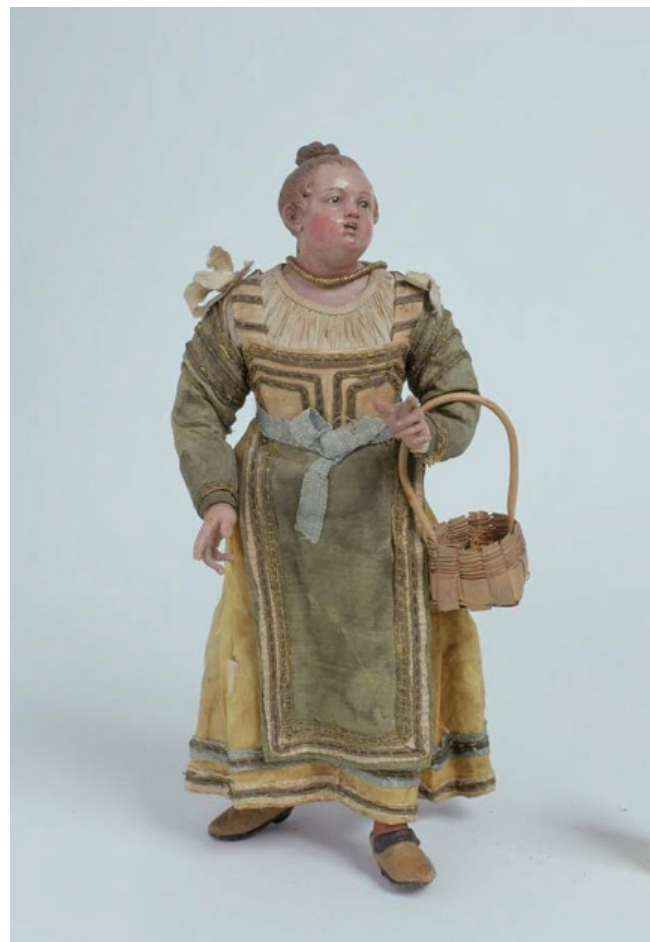
Fig. 3 Young Peasant with a Basket from a Neapolitan Nativity Creche, second half of the eighteenth century, wire-frame figure lined with burlap that connects the extremities, carved in wood or in baked clay, height: 7.8 in. (20 cm). Museo de Historia, Madrid. Accessed via Digital Library Memory of Madrid - CC BY-NC.