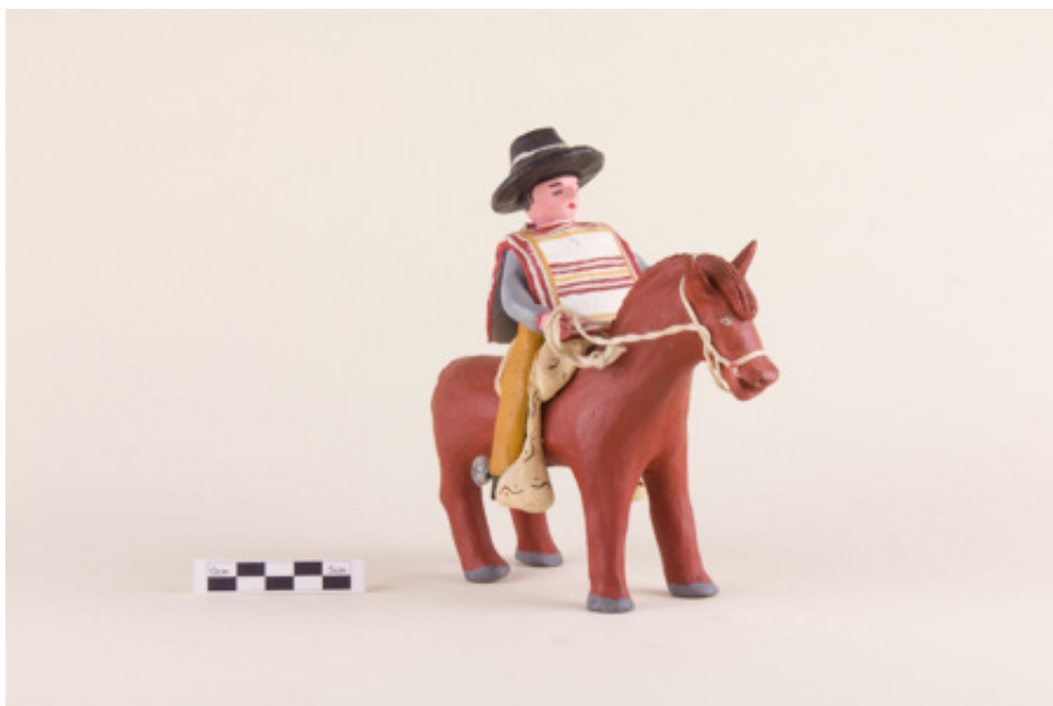
Fig. 12 Huaso Figurine from the Central Valley of Chile , early twentieth century, painted clay, approx. 6 x 6 in. (15 x 15 cm). Villa Cultural Huilquilemu, Huilquilemu, Chile.