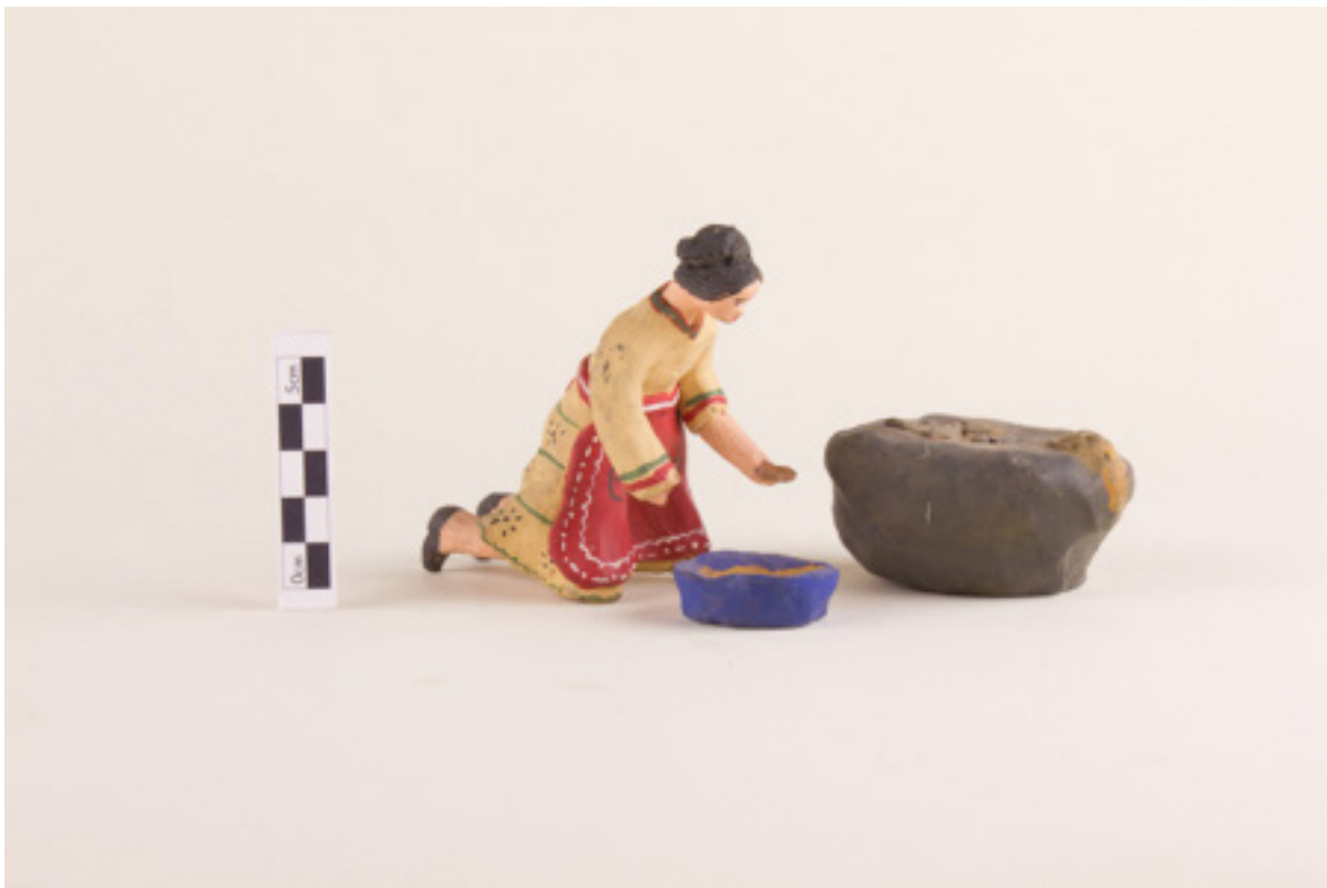
Fig. 19 Figurine from the Central Valley of Chile of a Woman Preparing Bread , early twentieth century, painted clay, approx. 4 x 4 in. (10 x 10 cm). Villa Cultural Huilquilemu, Huilquilemu, Chile.