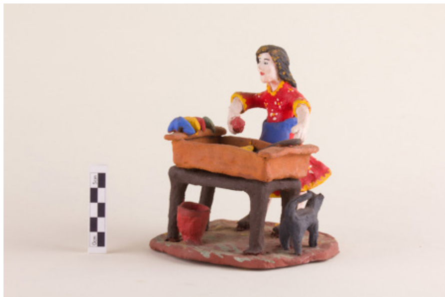
Fig. 22 Figurine from the Central Valley of Chile of a Woman Washing Clothes , early twentieth century, painted clay, approx. 5 x 4 in. (12 x 10 cm). Villa Cultural Huilquilemu, Huilquilemu, Chile.