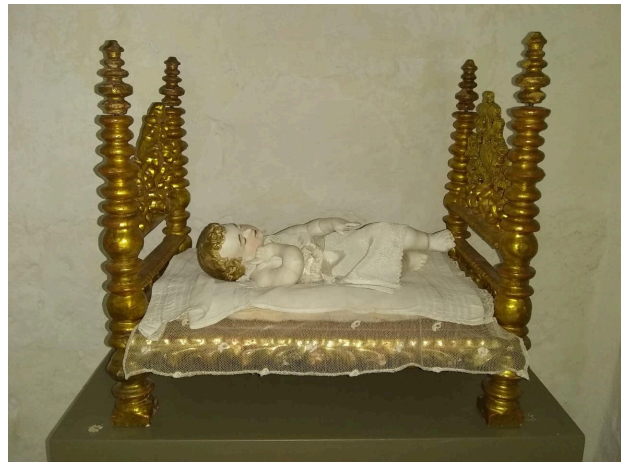
Figure 4. Unknown artist, Child Jesus in Cradle with Canopy , first half of the 18th century, Cuzco. Carved wood and polychromy. Arequipa, Perú, Museo de Arte Virreinal de Santa Teresa.