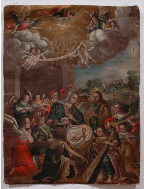
Figure 1. Unknown artist, The Nativity with Musical Angels , 18th century, Peru. Oil on canvas, 53 x 40 cm. Collection of Carl & Marilyn Thoma.