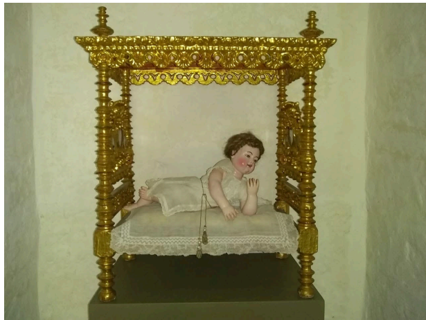
Figure 3. Unknown artist, Child Jesus in Cradle with Canopy , late 18th century. Marble and gold leaf. Arequipa, Perú, Museo de Arte Virreinal de Santa Teresa.