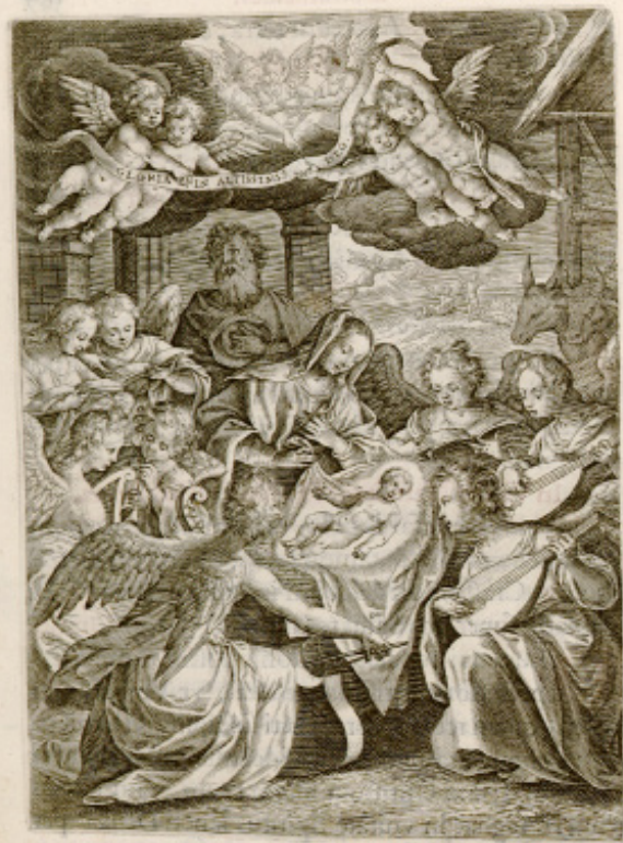
Figure 5. "The Nativity," in Officium Beatae Mariae Virginis Pii V Pontifex Maximus iussum editum (Antuerpie: Ioannem Moretum, 1609), 568. Engraving. Biblioteca Histórica de la Universidad Complutense de Madrid, BH FLL, 3908.