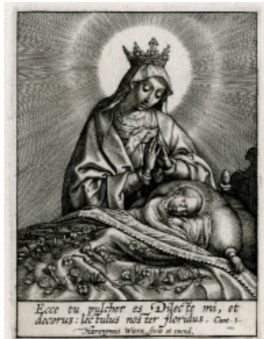
Figure 6. Hieronymus Wierix, The Virgin and Sleeping Christ Child , before 1619. Engraving, 8 x 6 cm. The British Museum, 1859,0709.3031.