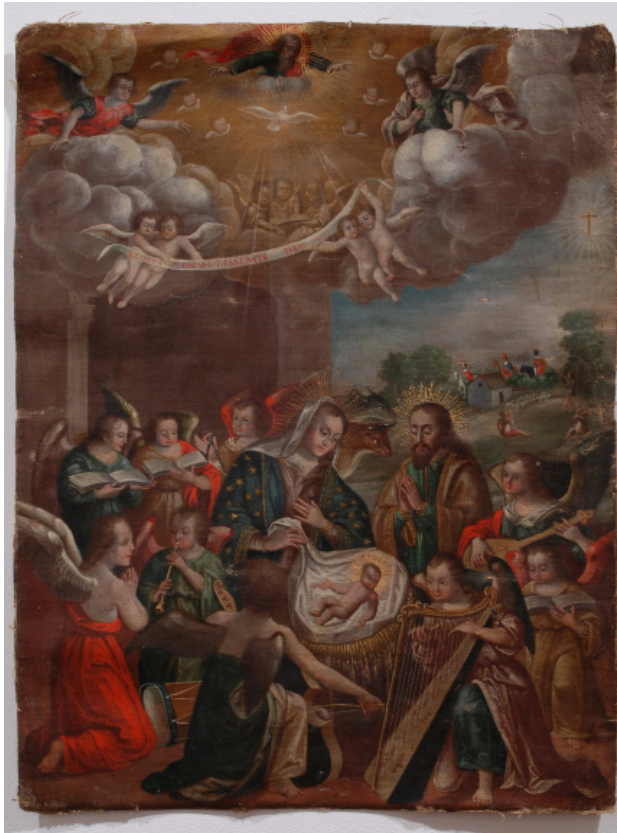
Figure 1. Unknown artist, The Nativity with Musical Angels , 18th century, Peru. Oil on canvas, 53 x 40 cm. Collection of Carl & Marilyn Thoma.

The musical component of The Nativity with Musical Angels dominates the composition and immediately captures the viewer's attention (Fig. 1). The canvas depicts baby Jesus at the manger with Mary, Joseph and a surrounding crowd of musical angels. Angelic choirs that praise and adore Jesus in the stable of Bethlehem constitute an old pictorial theme dating to the Byzantine period. 21 In European Renaissance paintings, it is common to see a small group of angels singing and playing instruments close to the manger, although more elaborate ensembles of musician angels playing strings, woodwinds, brass, keyboard, and percussion instruments appear in artworks from Northern Europe representing the Virgin Mary nursing her child. In The Nativity , musician angels, positioned in two different registers occupy most of the pictorial space. The composition was copied from an engraving, probably by Hieronymus Wierix, originally included in the Office of the Blessed Virgin Mary published by Jan Moretus in 1609 in Antwerp (Fig. 5). 22