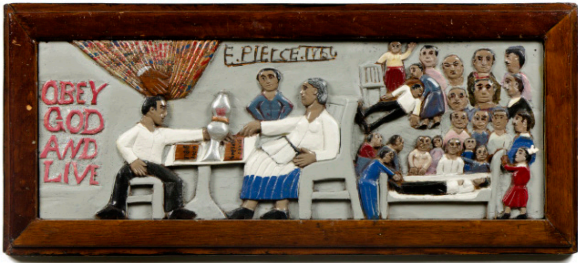
Fig. 1 Elijah Pierce, Obey God and Live (Vision of Heaven) , 1956 (ca. 1946)

This essay was commissioned by the Columbus Museum of Art to appear in Reflections: The Columbus Museum of Art's American Collection (Columbus: Columbus Museum of Art in Association with Ohio University Press, Athens, 2019). We publish it here with permission from the museum.