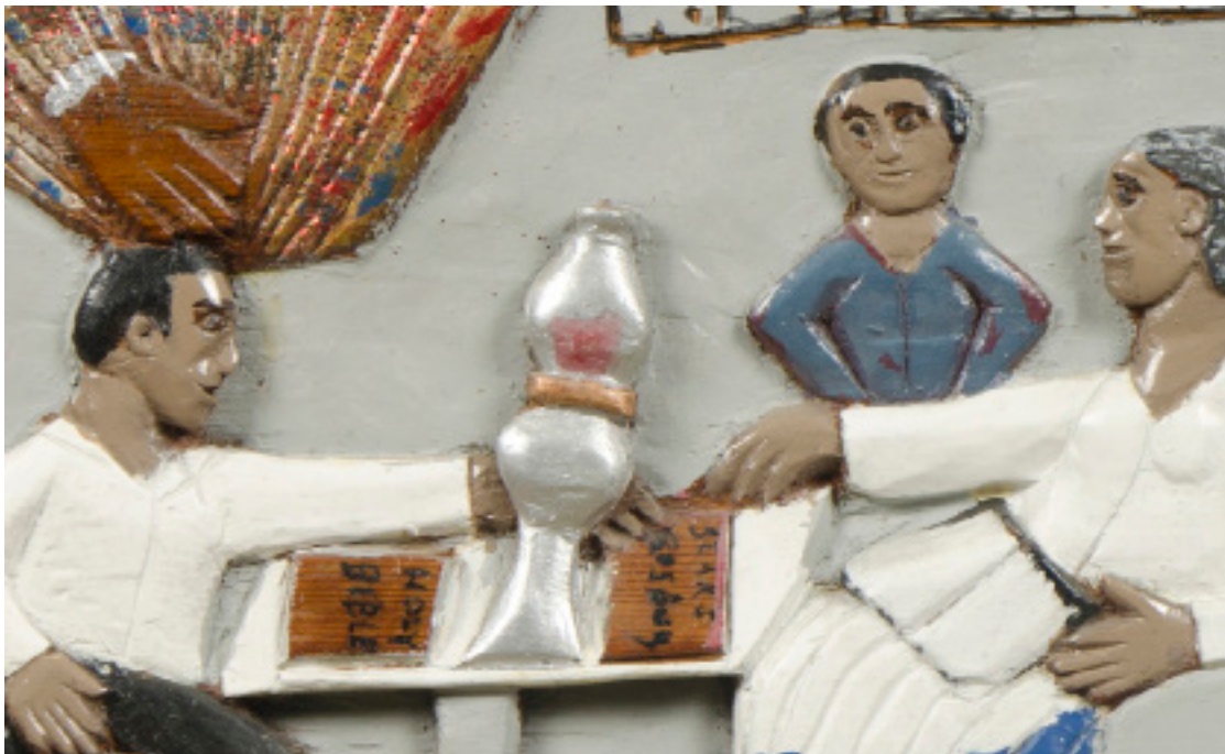
Fig. 2 detail, Elijah Pierce, Obey God and Live

Pierce pictures this literal, tactile connection in his carving. He used gold glitter, relative scale, and placement within his composition to call the viewer's attention to the space where the hand of God, issuing forth from a funnel-shaped energy field of light, comes into contact with Pierce's own head. He would look back later and note that he had been marked since birth as a prophet or seer, as one with a religious vocation. He was born with a caul, relatives told him—a “veil,” he called it—that portion of the amniotic sac that sometimes covers a newborn's head, interpreted from ancient times as a sign of calling, of being set apart for sanctity or prophecy or greatness of some other sort. In the world of earthly pleasures this kind of expectation can be burden as well as blessing.