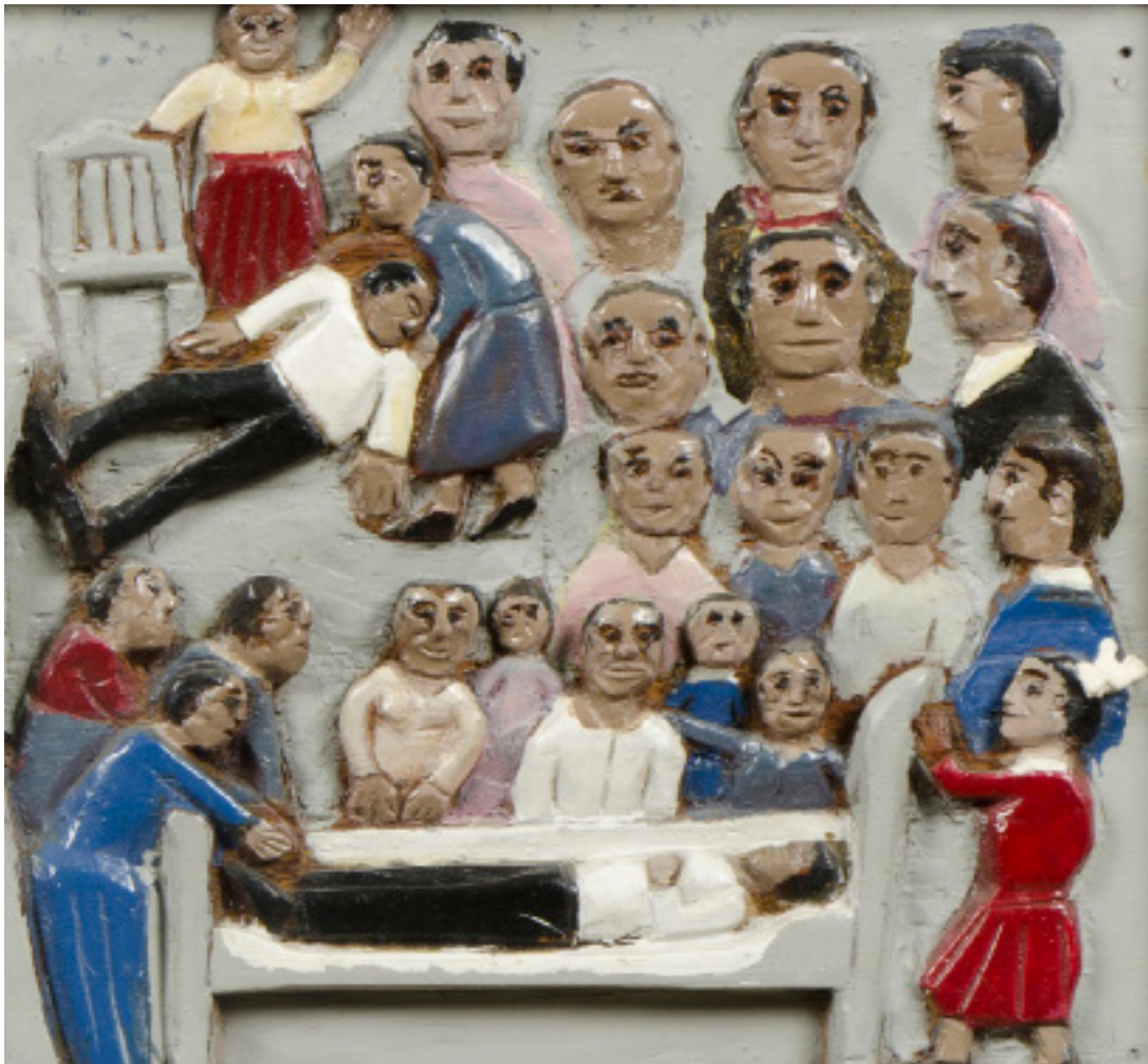
Fig. 3 detail, Elijah Pierce, Obey God and Live

as a miracle story more than a tale of judgment, though miracle and judgment are not antithetical here: “Obey God and live!” is but a short (though important) step away from “Obey God or die!,” as Pierce implied when he said, “I was laid out for dead once by not doing what the Good Lord told me to do.” 3