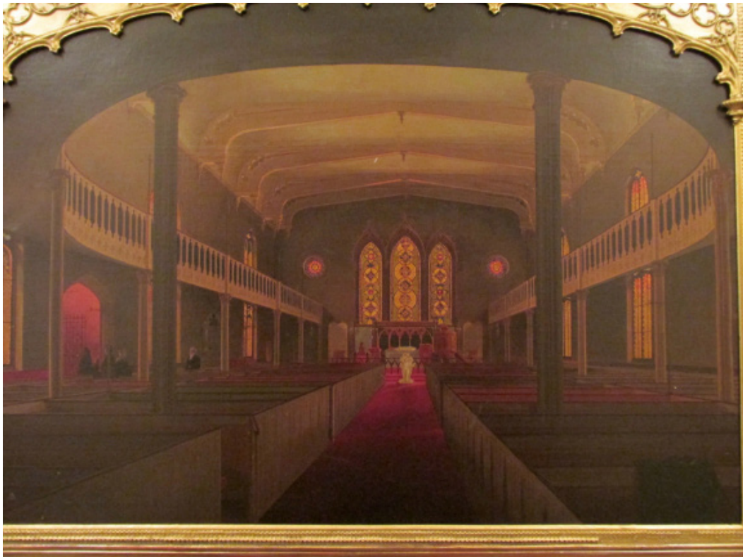
Fig. 11 Unidentified painter, View of the Interior of St. Stephen's Church, ca. 1860