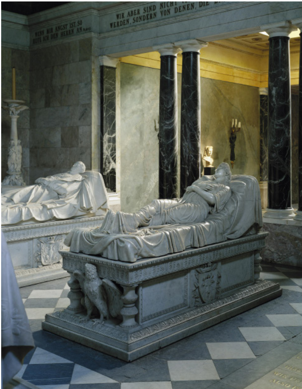
Fig 9. Christian Daniel Rauch, Effigy tomb of Queen Louise of Prussia, ca.1810-14. Charlottenburg Castle, Potsdam.