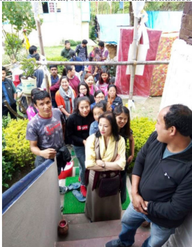
Figure 6. Waiting to meet the Bum, Sindrang, 2019.