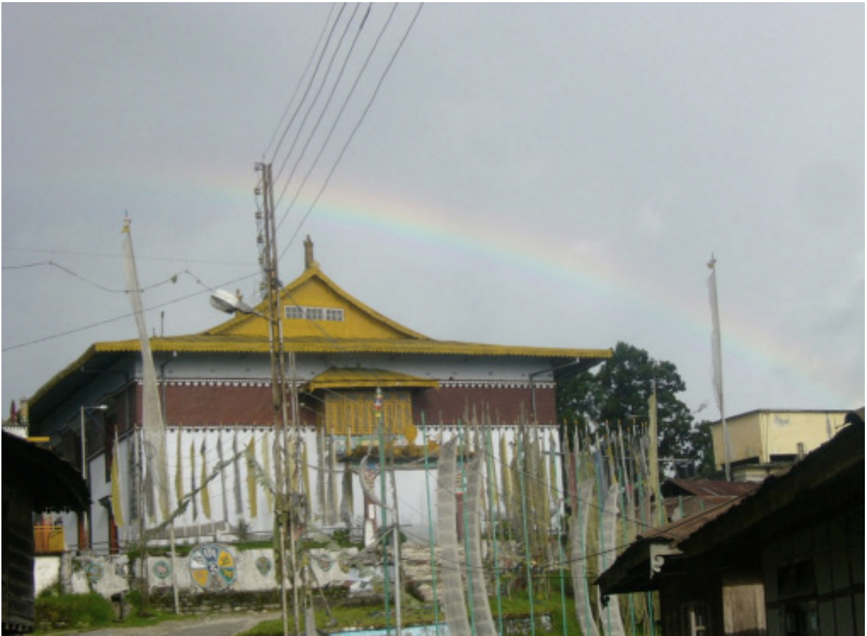
Figure 2. Pemayangtse Monastery, 2007.

to decide the logistics of the procession, including how many lamas and villagers would accompany the text, and the location of the patron's house who would host the Bum before the procession left to circumambulate the village. An organization committee was formed to coordinate the circulation of the Bum between the villages historically associated with Pemayangtse. The committee was made up of at least one representative of the primary jindak (Tibetan: sbyin bdag ), or sponsor household from each village, who prepared a shrine for the books and held a ritual (Tibetan: zhabs rten ) and feast (Tibetan: tshogs ) for the representatives from Pemayangtse who accompany the books. These representatives included tantric practitioners known as trapa (Tibetan: grwa pa ) 42 and machen, or "cooks" (Tibetan: ma byan ), who function as ritual managers, from Pemayangtse, who visited the sponsor households ahead of the beginning of the ritual to help set up the ritual shrines required. 43 In many instances, the lamas and patrons were actually the same people, since lamas are drawn from the villages around Pemayangtse and also maintain the responsibility of hosting the Bum as part of their family ritual calendar.