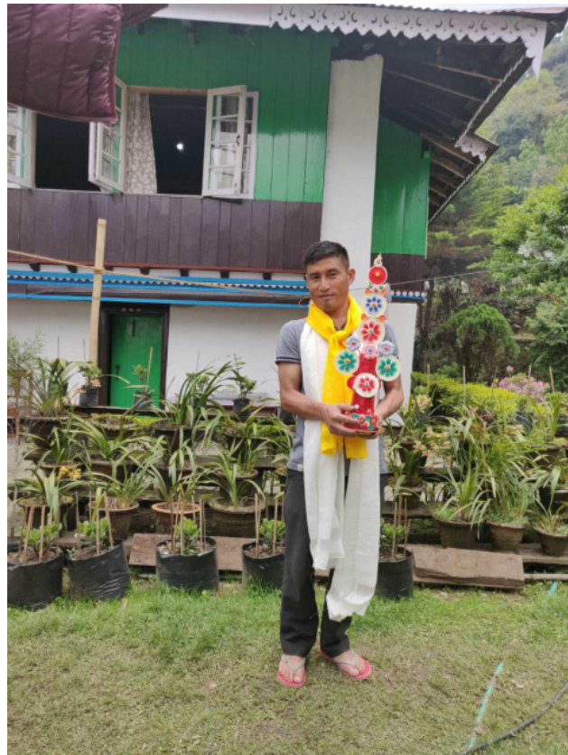
Figure 10. The sponsor for next year’s Bum holds the Jindak Torma, Sindrang, 2019.

circumambulation rituals to date is Geoff Childs’s article, “How to Fund a Ritual: Notes on the Social Usage of the Kanjur (Bka’ gyur) in a Tibetan Village,” published in the Tibet Journal in 2005. 60 This article drew on Childs’s extensive fieldwork in the ethnically Tibetan village of Sama and outlined the lives of two xylographic editions of the Kangyur that resided there. Childs witnessed the Kangyur Kora there in 1997 on the sixteenth day of the second month of the lunar calendar (March 25). The tradition was to always hold it on an auspicious day after the fifteenth day of the second month during spring. As in Sikkim, this was an important period when laity had sufficient time to commit to the venture as it is just as agricultural chores were starting after the winter months. Men had also completed periods of retreat after winter, and there was also a downturn in trade and the depletion of food stocks by that point in the year. 61