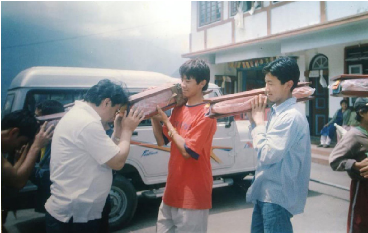
Figure 5. Taking blessings from the Bum, c. early 2000s.

the next jindak's house in Singyang. The Bum spent a night there, and then moved onto the other villages, including Naku-Chombong (Bhutia: Na ko gcong phung ), Arithang (Bhutia: A ri thang , and Sakyong-Yangthey (Bhutia: Sa skyong g.yang thing ) for a night each before returning to the monastery. Within the last two decades, the Bum has