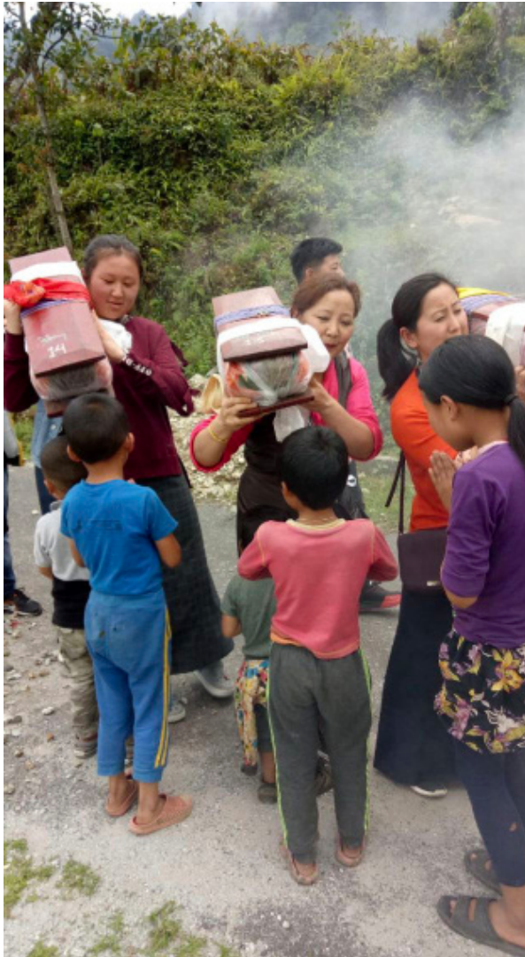
Figure 8. The Bum procession around Sindrang village, 2019.

We all go to meet the Bum when it visits and circles our fields to express our appreciation to the Buddha and to express our hope for good harvests and also for the health of our animals and all the other unseen beings. In the last few years, we have been especially worried about the soil, because the cardamom that is the most