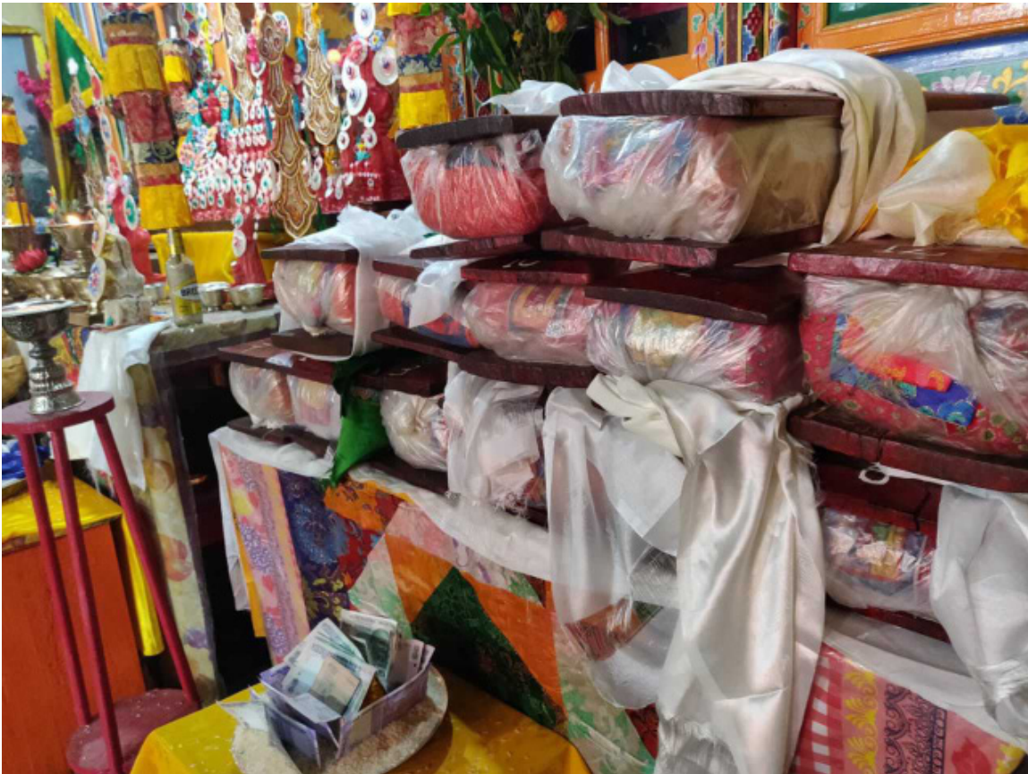
Figure 3. The Bum in the household shrine at Sindrang, 2019.