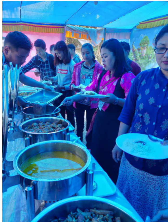
Figure 11. Feasting after the Bum, Sindrang, 2019.

38 The kora witnessed by Childs took place after ritual specialists and monastics had read the Kangyur over a period of nine days at the local religious center of Pema Choeling (Tibetan: Pad ma chos gling ). During this reading, many villagers volunteered food, firewood and labor to care for the forty readers. Afterwards, men strapped volumes of the Kangyur to their backs before carrying them down the hill from the religious center, where local lay people waited at the base of the hill burning juniper. Childs then describes how the Kangyur was carried “around the perimeter of the village and surrounding fields. The route was broken into sections. After circumambulating each section, the entourage stopped and all participants were served food and refreshments at one of four different homes.” 62 The progression of the kora took place over a day, “alternat[ing] between circumambulating and feasting.” 63 The day ended with a ritual masked dance (Tibetan: 'cham ) before the Kangyur volumes were returned to their alcoves in the temple.