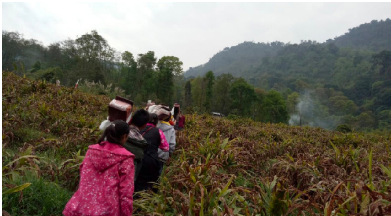
Figure 1. The Bumkor around the fields of Sindrang, 2019.