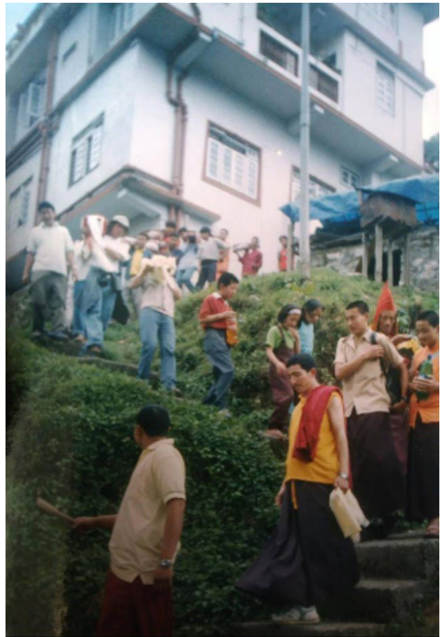
Figure 4. Procession including trapas and villagers leading the Bum down to Sindrang, c. early 2000s.

26 Once the Bum volumes arrive at the jindak, or sponsor household's, home in Sindrang, they were laid out for people to take blessings. There was then large ritual from the local Buddhist lineage of the Gathering of the Knowledge Holders (Tibetan: Rig 'dzin srog sgrub ) that is held to have been revealed in a vision inspired by the landscape of Sikkim by the Tibetan yogi Lhatsun Namkhai Jigme. Other religious specialists and lamas resident in the village congregated in the household shrine to meet the Bum to take blessings when it arrived. Laypeople came to visit the Bum in the shrine, prostrating to the books and offering scarves.