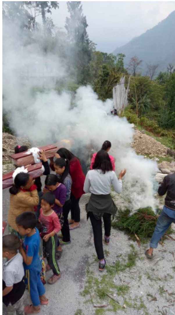
Figure 9. The Bum procession around Sindrang village, 2019.

profitable of our crops has been struck by illness. 58 When the Bumkor comes this year, then, we are hoping that it will prevent damage to the new crops we put in this year and that the cardamom may be healed. 59