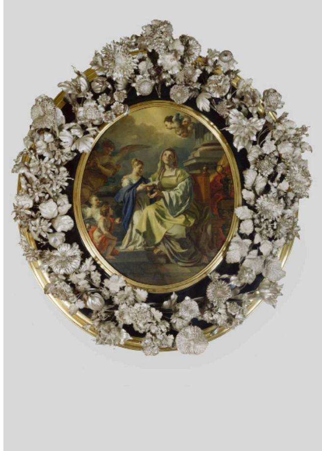
Fig. 27 Francesco Solimena, Education of the Virgin , oil on copper, silver, 1720s, Palazzo Pitti, Florence.

the mines of something now lost that silver both kept alive and extinguished.