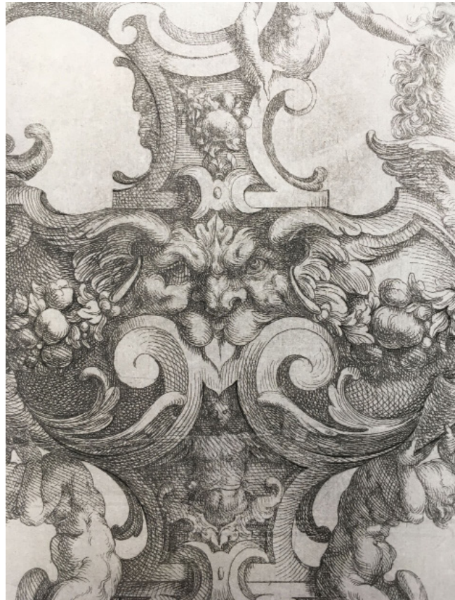
Fig. 20 Orazio Scoppa, A design impossible to execute in silver , etching, 1642-43. British Museum Prints and Drawings.