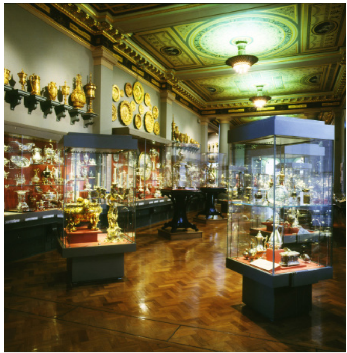
Fig. 4 Silver Gallery of the V&A Museum. Tellingly, the V&A continues to prohibit the publication of any images of its silver galleries that are not its own.

Atlantic, from raw material, recognized as enmeshed in exploitation and colonialism, to refined elegant object, produced as if by magic by mostly anonymous silversmiths, celebrated as virtuosic and sophisticated, a splendid marker of the exquisite taste of the elites. This prompts the question: in what ways might the conventional interpretation of silver in Europe have to be overturned for its politics to be exposed? Are the conventional taxonomies in fact ways to avoid engagement with material trauma or even its effects?