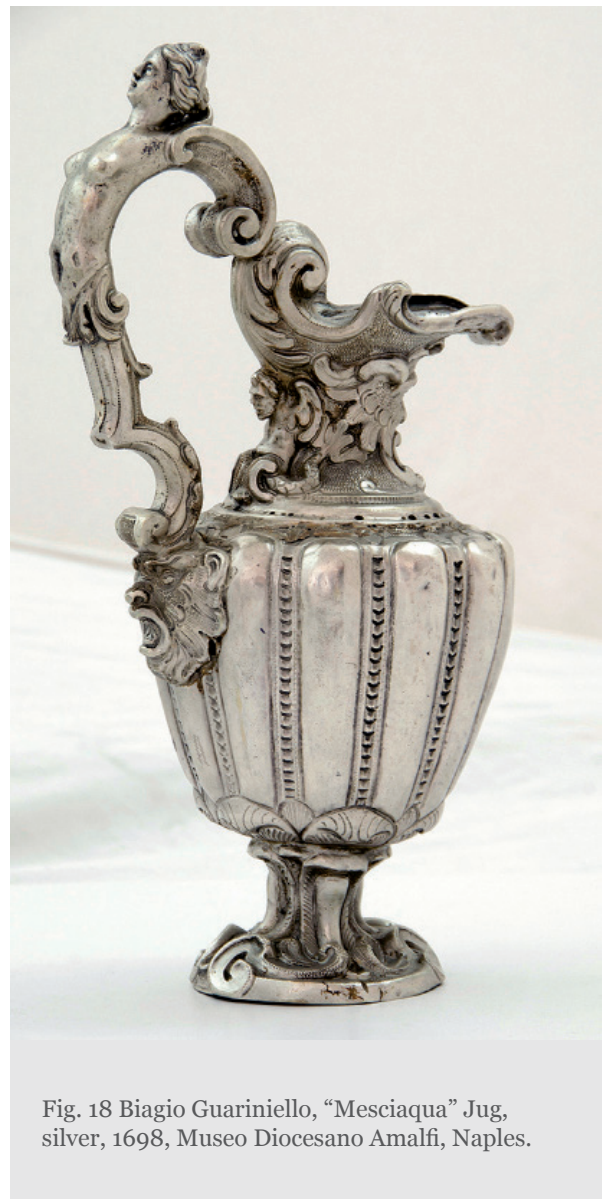
Fig. 18 Biagio Guariniello, “Mesciaqua” Jug, silver, 1698, Museo Diocesano Amalfi, Naples.

38 Points of contact tended to be animated figuratively. Handles might be eroticized (Fig. 18). A small cup, now at Capodimonte, was made by silversmith “C.M.” in 1712 in embossed silver with cast handles (Fig. 19). 50 This large ewer (Fig. 18) ended up in Amalfi Cathedral Treasury whose website insists that it was made for secular use and only given to the Cathedral subsequently. One can see why. The double volute handle consists of the arched body of a naked woman offering herself to be handled every time the jug is used. She flaunts her breasts on the cusp of the curve, handy for exploration by finger or thumb; her genitals, while absent in ostensible modesty, are substituted by a suggestive volute that at once covers, replaces and amplifies them, its swirling movement inviting a delirium of agitation in the imagination. Meanwhile the lower volute curve of the handle offers abstracted forms for knee, calf and foot, permitting the