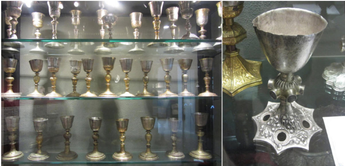
Fig. 2 Chalices, silver, ca. 16th-18th centuries. Museo Nicolaiano, Bari.

was a guarantor of success. Yet silver also marked the ruthless plunder of European colonialism, the genocidal degradation of native workers, and ecological ruination (Fig. 3). 3 Brutal conquest; remorseless exploitation; social, political, and religious luster. Was one somehow necessary for the other, threaded through the dark machinations of European power? Silver is a particularly fraught, agile, and transformative material. Embedded in power relations, coloniality, and matters of purification, early modern silver was a particularly generative site. Might its peculiar paradoxes be usefully thought in terms of a materiality of trauma? This essay is a first step in this direction, focusing on the fate of silver in Naples, as capital of the colonized. Naples, in its position as viceregal capital of the Spanish empire in Europe was a key site in which, through which, and by which brute colonialism was transformed into elite culture whereby, in turn, that colonialism was justified, upheld, and extended.