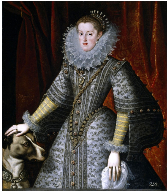
Fig. 1 Bartolomé González y Serrano, Queen Margaret of Austria , 1609, oil on canvas, 116 x 100 cm, Museo del Prado.