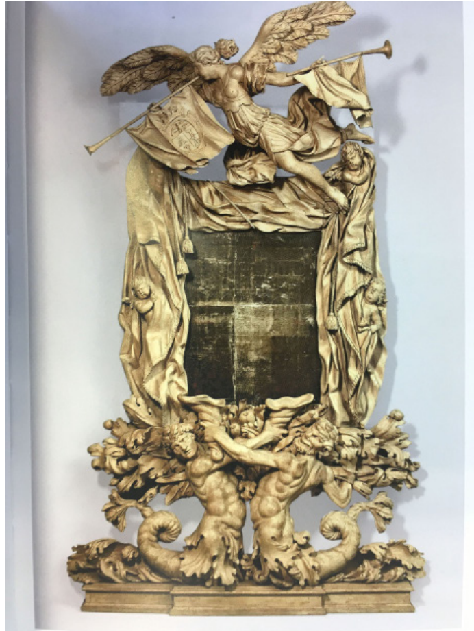
Fig. 13 Workshop of Andrea Fantoni, celebratory mirror, ca. 1695-98. Casa Fantoni.

thick folds of fabric, as if dressed, as fabric clung to the frames of those who gazed at the silvered glass to see themselves and their companions glitter back alluringly in the glow of candlelight. Marine creatures, flourishing flambeaux, support the mirror and its terrestrial register, above which improbably aerial spirits triumph. The mirror implies its own transformative capacity to bear aloft, to offer those reflected in its silvery surface an analogous transcendent capacity. To look in such a mirror was to be enlivened by its glittering promise to be freed from mundanity and elevated into lighter, higher unencumbered realms.