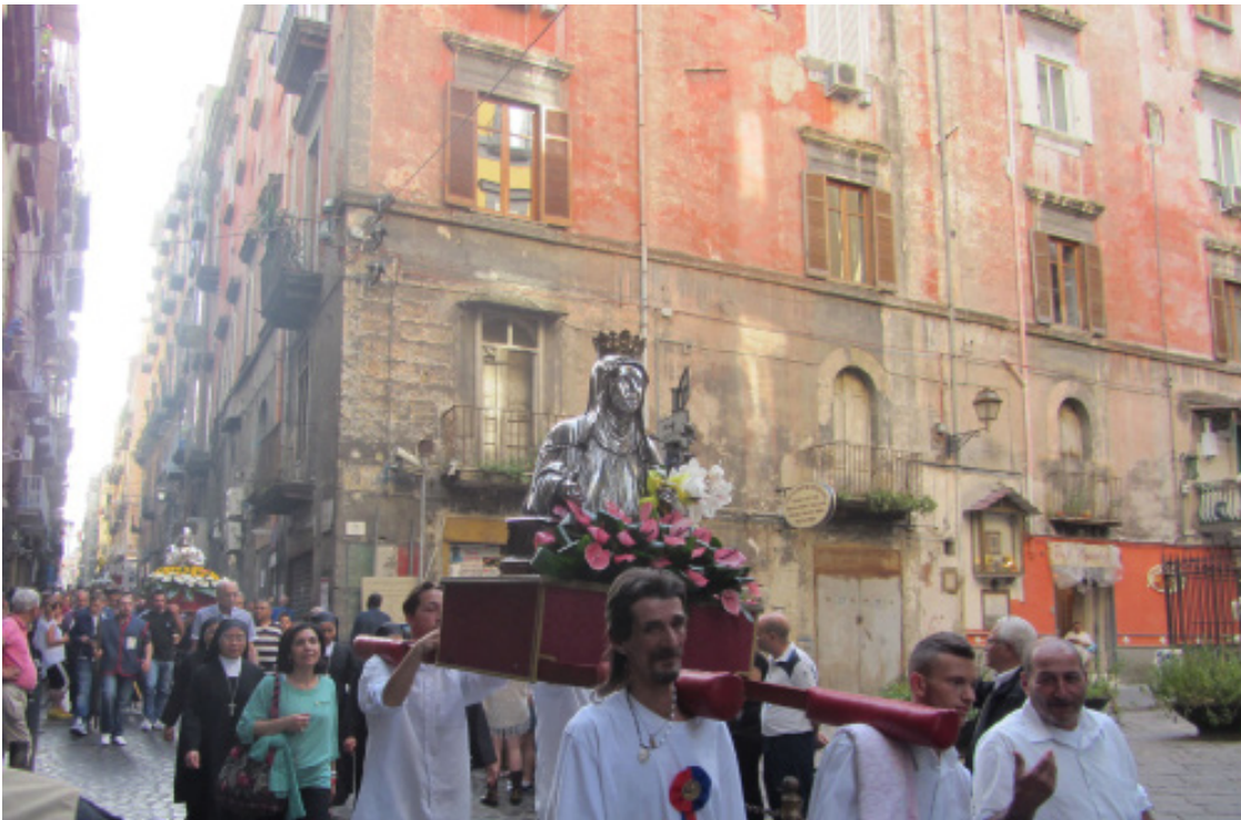
Fig. 8 Silver reliquary bust of St. Patricia in the procession of silver saints in honor of San Gennaro (2013), Naples.