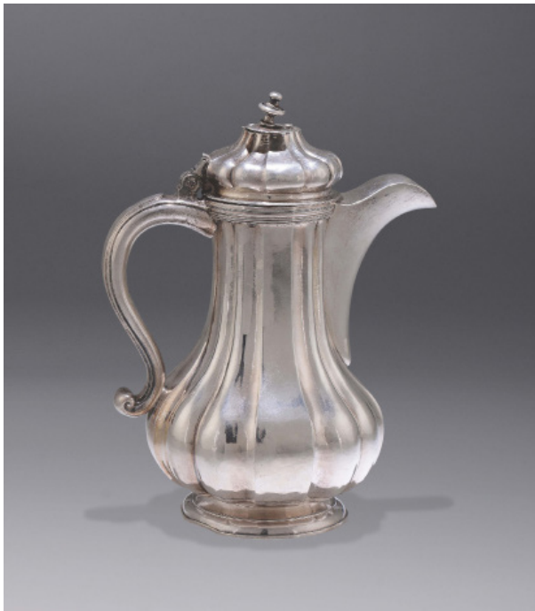
Fig. 16 Cioccolateria with mark of silversmith “GR” (Gius Raimondi or Giuseppe Ricciardi), consular stamp N.PC (1746), embossed, chiseled, engraved silver, Naples, Museo e Real Bosco di Capodimonte.