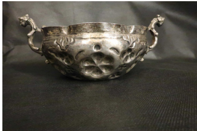
Fig. 19 Small cup, silver, inscribed "C(?) M. NAP.1712 CM," Museo e Real Bosco di Capodimonte (DC819).