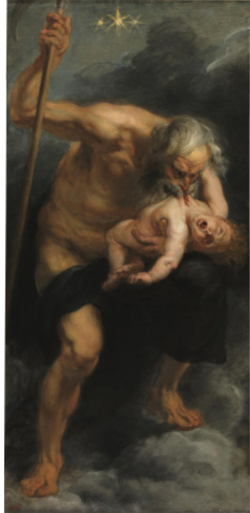
Fig. 12 Peter Paul Rubens, Saturn Devours a Son , oil on canvas, 1636-38, 182.5 x 87 cm, Museo del Prado.