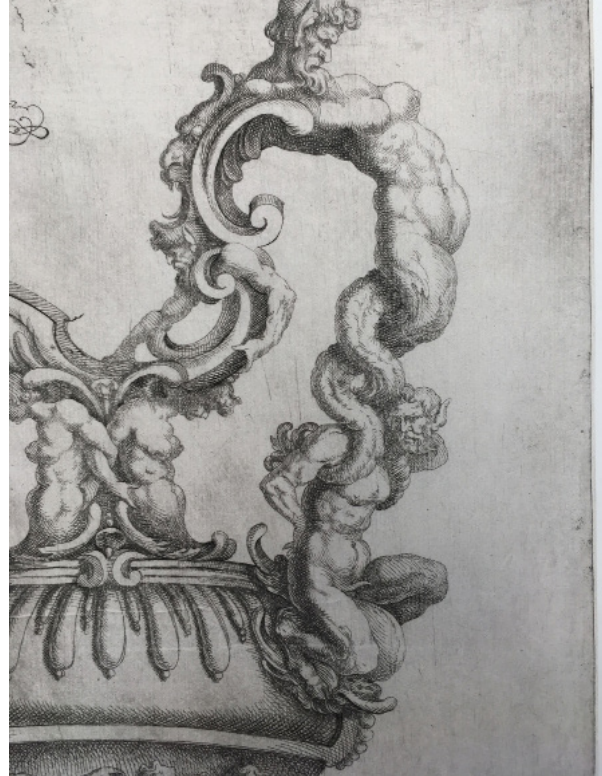
Fig. 23 Orazio Scoppa, Ewer No. 8 (detail), etching, 1642, British Museum, Department of Prints and Drawings (W6-151). An old man's head peers down over a female body, whose breasts and abdomen thrust provocatively forward, only to dissolve into serpentine legs, whose frond-like ends tuck under the armpits of a not quite ithyphallic satyr. British Museum Prints and Drawings.

44 In his guide book to Naples of 1692 Carlo Celano emphasized the city's unsurpassed gold thread, lace and embroidery: "Here [in Naples] is made the most delicate lace of gold thread and of silk, which is inferior in no way to that of Venice or Flanders." 54 "Here are made the most bizarre embroideries of all sorts, that perhaps have no equal in Italy; and they are so much in use that there is no modestly comfortable house that does not have them." 55 Celano emphasizes both the widespread manufacture and consumption of metallic lace and its marvelous capacities: