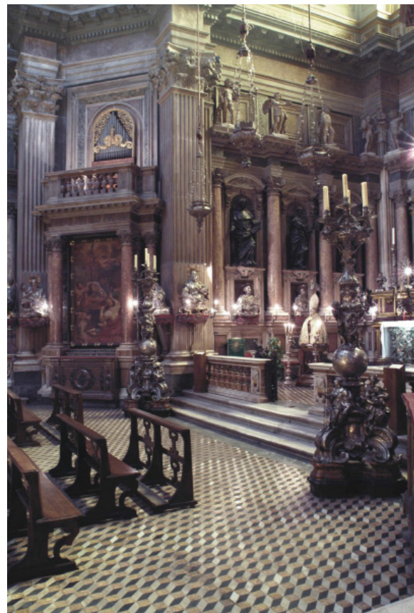
Fig. 9 Treasury Chapel of San Gennaro with silver saints and silver splendori, chapel ca. 1608, reliquary bust of San Gennaro ca. 1304-5, most reliquaries are 17th century.