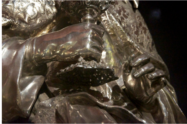
Fig. 10 Reliquary of St. Clare (detail), Museo del Tesoro di San Gennaro, Naples.

25 More than 350 workshops were based in the Orefici quarter, in each of which worked mostly family groups of several artisans. 28 Entire generations of silversmiths included the Maiorani, Porzio, Treglia, Avitabile, Buonacquisto, Carpentiero, d'Aula, Guarniello, and Del Giudice families of great prestige in the seventeenth century. They produced vast quantities of silverware for churches, convents, monasteries, aristocrats, and rich merchants in Naples, its Kingdom, and beyond. 29 Thus Aniello Treglia, who specialized in large works, made the marvelous altar frontal