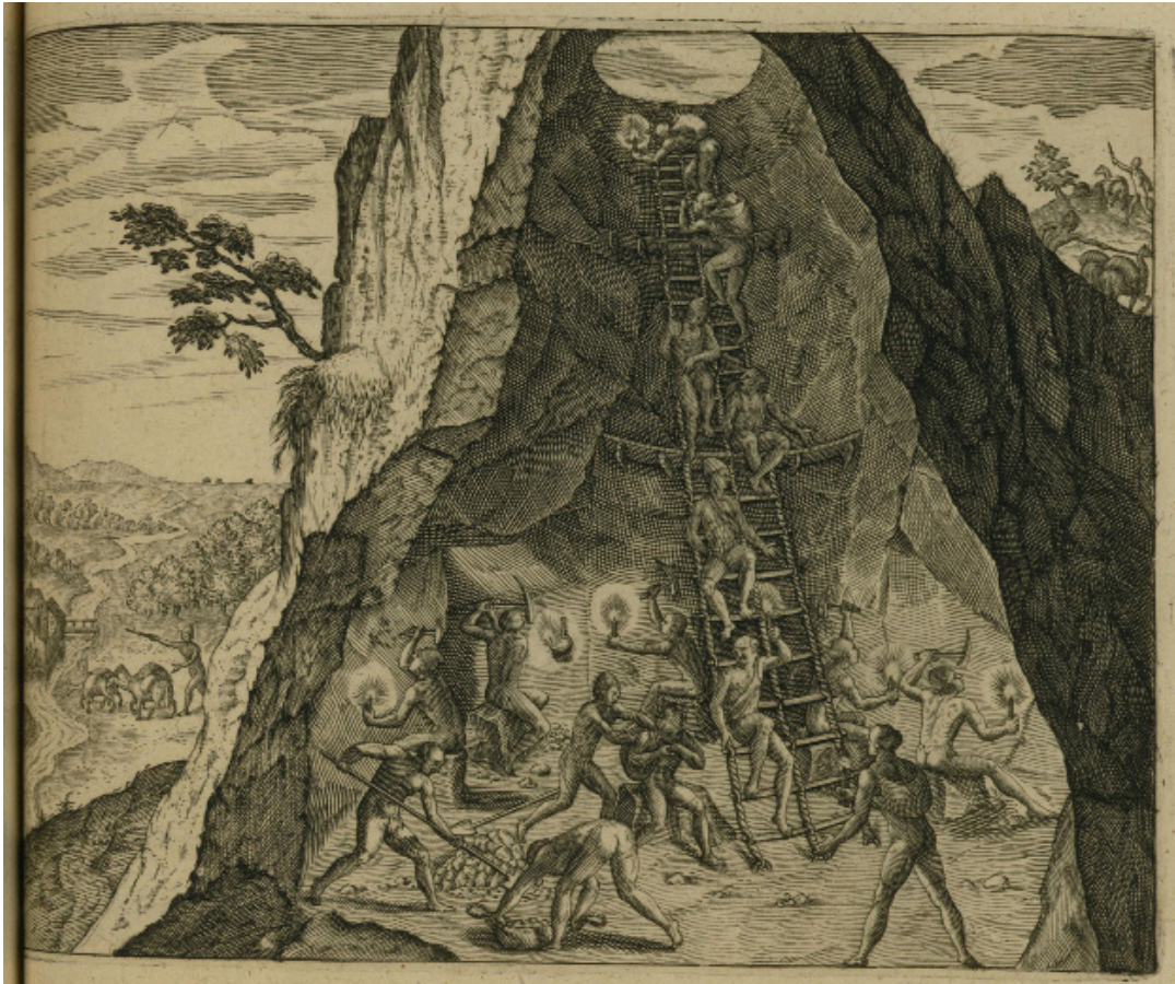
Fig. 3 Theodor de Bry, Wie die Indianer das Goldt aus den Bergen graben (detail), engraving, Image: 14.8 x 19 cm, page: 35.3 x 23.3 cm, from Theodor de Bry, America , part 9 (Frankfurt am Main: Bey Wolfgang Richter, 1601). Although not an accurate depiction, this image evidences awareness in European circles of the deplorable conditions in Andean silver mines. John Carter Brown Library.

collude in the glamor (at once superficial, material, profound) of colonialist effects. This is particularly marked with regard to the study of precious metals, although it extends way beyond them. Jennifer Montagu, one of the few art historians to engage with silver baroque artifacts, approaches them as “objects for the display of virtuoso silversmithing” and “symbols of their owners’ wealth.” 6 What is now urgently required is art historical analysis that goes beyond conjugating colonial history and the isolated study of fine objects.