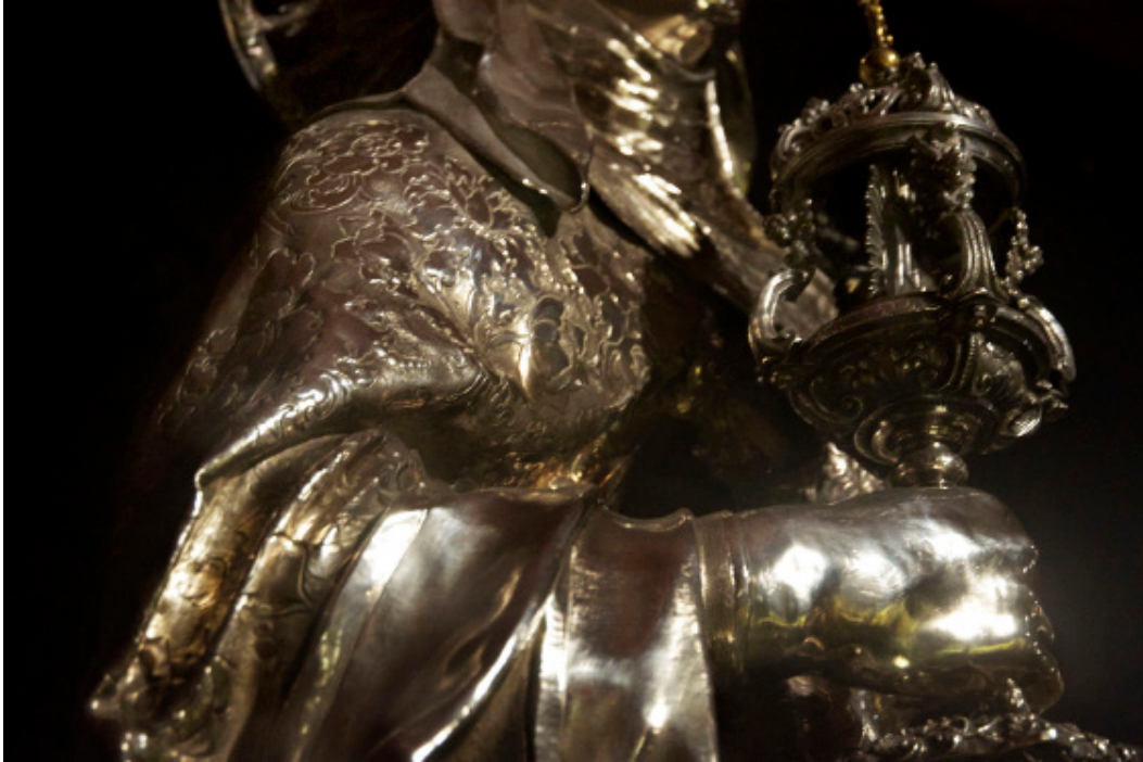
Fig. 24 Silver out of the dark a flash here and a gleam there. Reliquary of St. Clare (detail), Museo del Tesoro di San Gennaro.