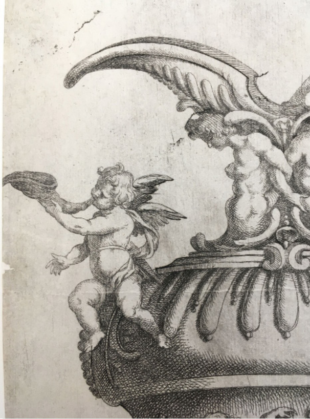
Fig. 22 Orazio Scoppa, Ewer No. 8 (detail), etching, 1642, British Museum, Department of Prints and Drawings (W6-151). A winged putto blows a conch, his form echoes and inverts that of the giant spout jutting over him. British Museum Prints and Drawings.

silver and gold in silver and gold thread, lace, spangles, and embroidery. Gilt silver or silver metal was drawn into wire by specialist wire drawers. The wires might be rolled to make strips ( lamellae ). The wire or lamella was then wound round a core thread, usually of silk to make silver-gilt and silver wire. Extravagant and brilliant technical skills invited you to stare, take a second look, to admire what thrillingly met the eye.