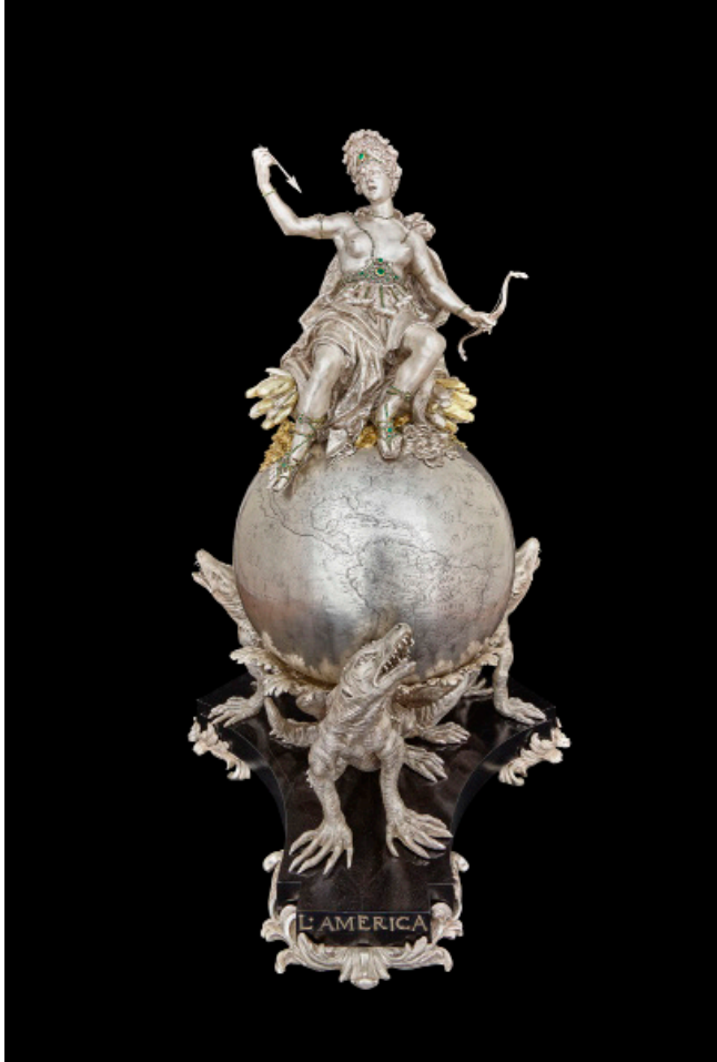
Fig. 11 Silver sculpture of “America,” one of four silver sculptures of the Four Continents, made to models by Lorenzo Vaccaro, commissioned for King Charles II by Fernando de Benavides, count of Esteban, viceroy of Naples 1687-95, and completed in 1695 (now in the Treasury of Toledo cathedral).

inventories, bills of payment, and suggestive oil paintings.