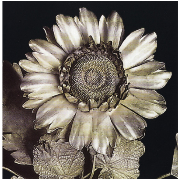
Fig. 26 Gennaro Monte, Vase of Flowers , silver, ca. 1667, 120 x 20 cm. Treasury Chapel of San Gennaro, Naples.