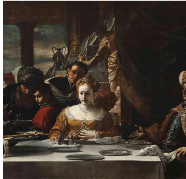
Fig. 25 Mattia Preti, Feast of Herodias (detail), oil on canvas, between 1656 and 1661, 177.8 x 252 cm, Toledo Museum of Art, Ohio.

Take this cup. Do this in remembrance of me. Sight, sheen, surface, sex, and seduction guaranteed aristocratic pleasure, dominance, power, and lineage in the great mating game that saved their souls and guaranteed their name was melded—even as it was rendered apparently devout, sophisticated, arch, and witty—to the very substance of colonial power.