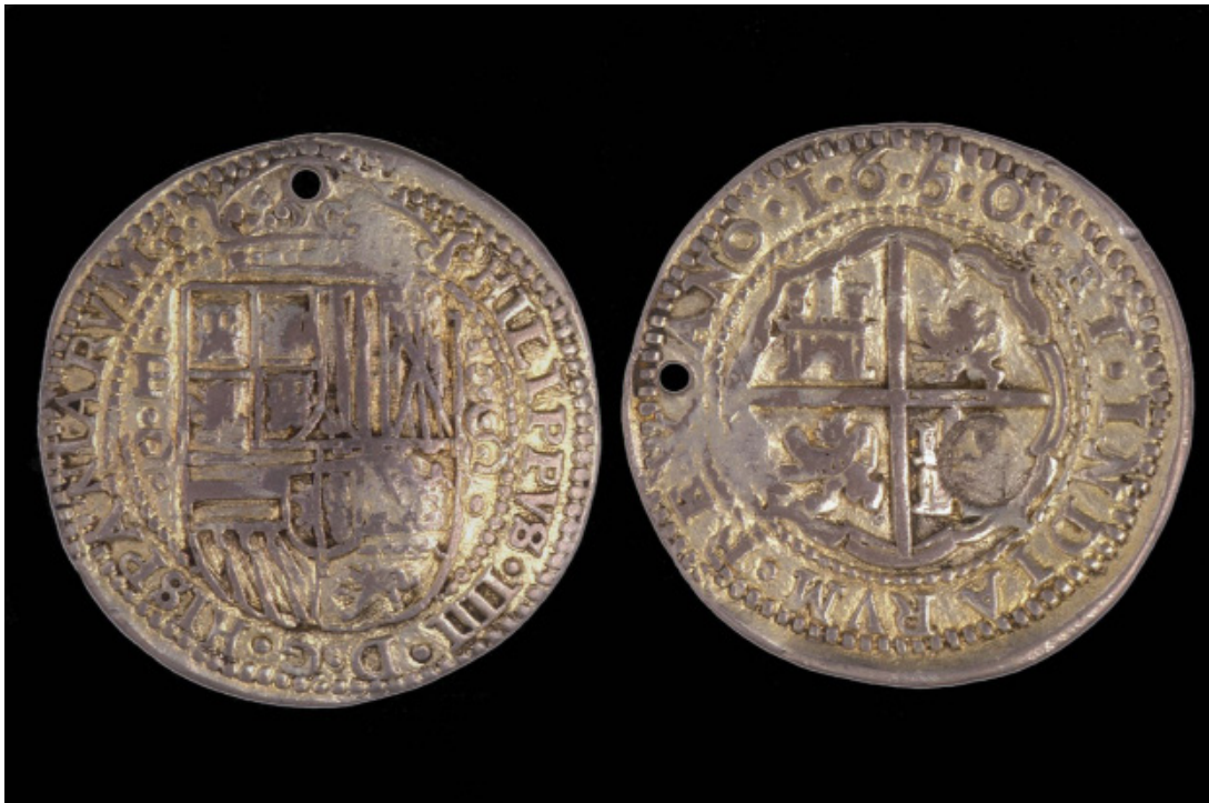
Fig. 5 Reales, minted in Potosí, 1650. American Numismatic Society, New York City. Reales (worth one-eighth of a peso) bore the Spanish monarchy and emblems of empire as far as the silver circulated.

13 of silver and 2,800 kilograms of gold in the years between 1600 and 1639. 17 Outputs during the early-seventeenth century of the gold and silver mints owned by the Spanish monarchy were considerably greater than in the later sixteenth century and were certainly much higher than that in England or France. 18 The Spanish inspector in Concolorcorvo's late-eighteenth-century Lazarillo de ciegos caminantes confronts an Indigenous person: