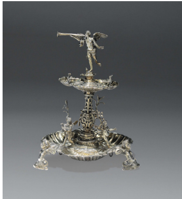
Fig. 17 Michele Patuongo (attributed), table centerpiece, fused, embossed, chiseled silver, 1704, consolato Giovan Battista Buonacquisto, Naples.