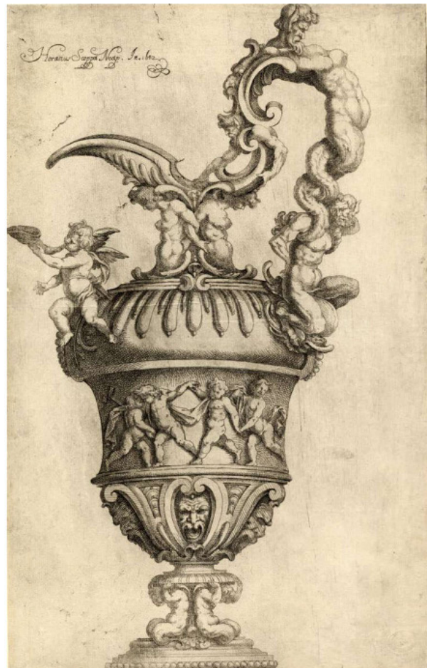
Fig. 21 Orazio Scoppa, Ewer No. 8 , etching, 1642, British Museum, Department of Prints and Drawings (W6-151). British Museum Prints and Drawings. Photo: Helen Hills.

43 Culturally, silver clad the court in a super, superior and supercilious shine. Nobles wore