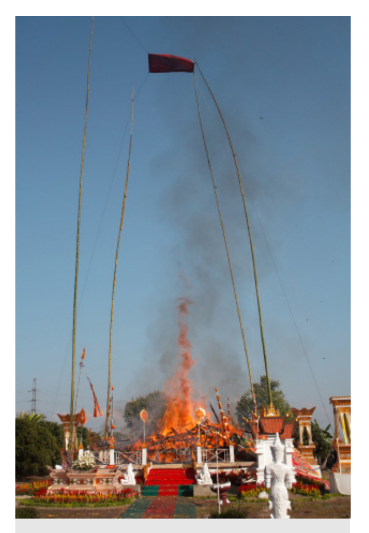
Fig. 11 The prasat sop in its final stages of burning. San Pa Tong District, Chiang Mai Province, Thailand, 2012.

The sight of a golden funeral structure is awe-inspiring, but the use of the golden hue becomes more meaningful with added understanding of the religious and social meaning and context. Because it commemorates the death of a high status and inspiring member of society, a monk's funeral brings attention to the essence of Buddhist perfection, evokes idealized visions of a heavenly afterlife, and emphasizes the core Buddhist teaching of impermanence. Each of these Buddhist elements present in the structure's coloration and form are of equal importance and tie into other visual representations of the same themes. Thus, the Northern Thai monk's funeral prasat is simultaneously part of a larger use of gold to illustrate and communicate Buddhist ideals and a very local means of applying these ideals in a very specific and unique context.