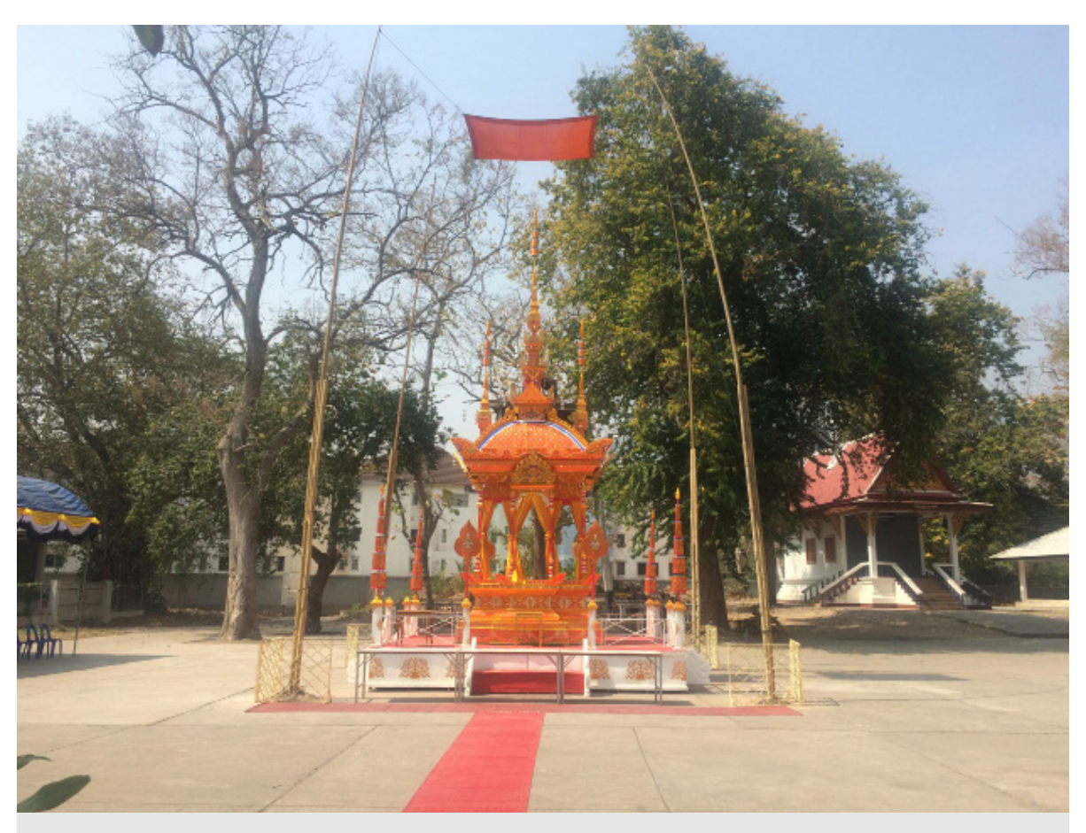
Fig. 3 Prasat sop. Note the open sides and roof spires. Wat Chang Khian, Chiang Mai Province, Thailand, 2016.

great respect and fervent adoration given to these monks is expressed in the production and circulation of their portraits in amulets, photographs, sculptures, and paintings (Fig. 2). Perhaps best known is the monk Kruba Siwichai (1878–1939), whose dedication to the people and sangha of Northern Thailand continues to be held with the highest appreciation, with his image and impact being celebrated to this day at temples large and small in the Chiang Mai and Lamphun area.<sup>5</sup> Prasat sop funeral structures and the cremation events that accompany them are tied into the deep bond Northern Thai Buddhists have with these holy men.<sup>6</sup>