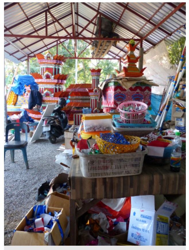
Fig. 6 Prasat nok hatsadiling workshop at Wat Koh Klang, Chiang Mai Province, Thailand, 2017.

city, functions for only part of the year during the cool season after the end of the rains retreat and ending before the Thai New Year in April (Fig. 6). The workshop attracts villagers, who can earn money through work, and students focused on learning traditional art forms, both in embellishment and process of creation. Each component of the prasat sop, from the delicately created papier mâché form to the detailed cut and collaged paper and the shaped pieces of foam are carefully created by a team of villagers at small work areas or stations around the space of the workshop area, an open-sided shed-like area located outside the walls of the temple. Specially trained monks oversee the production at Wat Koh Klang. At other regional workshops the methods and breakdown of production are similar, with lay specialists overseeing the work. In the days leading up to the funeral, all the different pieces are transported by truck to the cremation site, then assembled with great care over several days into the completed prasat sop form. A phachiwon or monk's outer robe is one