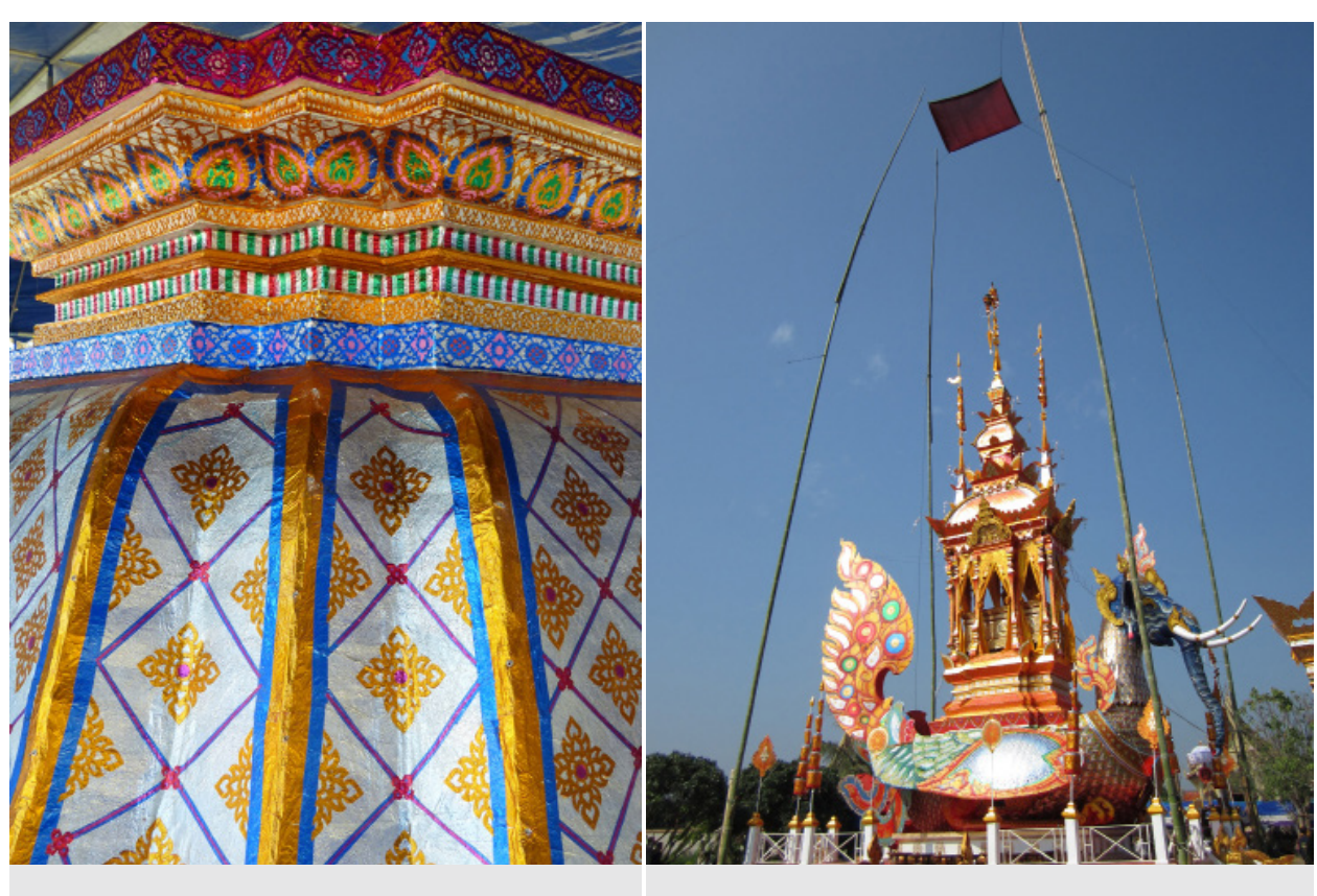
Fig. 4 Detail of embellished surface of monk's prasat sop, 2017. Chiang Mai Province, Thailand.