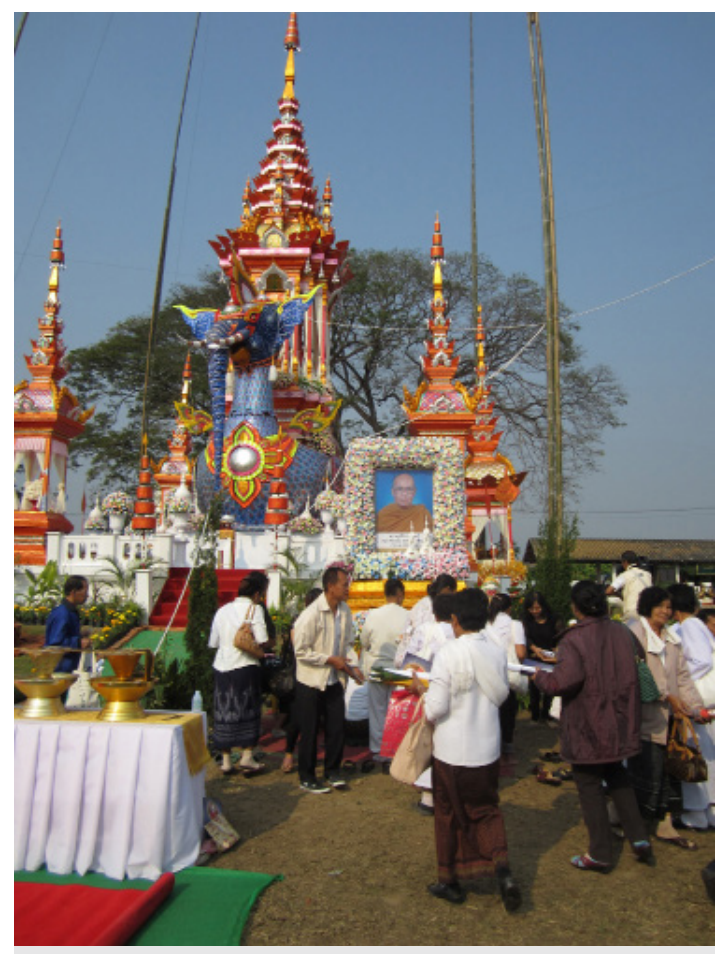
Fig. 10 The golden prasat sop surrounded by merit-making laity. Wat Kiew Lae Luang, San Pa Tong District, Chiang Mai Province, Thailand, 2016.

27 While any cremation makes the ever-changing aspect of existence clear, the public burning, together with the coffin and corpse, of a golden palace that took a significant amount of time and money to create makes it very clear. The simultaneous thrill and shock of seeing it burn commands attention and inspires contemplation about the inevitability of death and the opportunities for living a more complete, fulfilling life. The quick destruction of something so grand and golden and costly to produce reinforces the message of impermanence that runs throughout