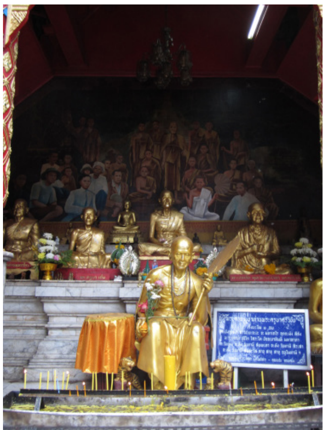
Fig. 2 Shrine to the monk Khruba Sriwichai, Wat Phra Thai Doi Suthep, Chiang Mai Province, Thailand.

An exploration of the relationship between prasat sop and Buddhist monks reveals the lofty status of dedicated monks in the eyes of residents of Northern Thailand. Once specifically associated with the Lanna royal family, these costly and eye-catching structures are closely tied to power in both a material and spiritual sense, as described in Lanna royal chronicles as far back as the sixteenth century.4 As the Lanna royal family lost influence and power due to nationalization efforts from Bangkok, charismatic and high ranking monks dedicated themselves not just to pursuing perfection, but also protecting the Buddhist religion, creating space for the exchange of actions for merit, and guiding followers through secular initiatives. They became central to maintaining Lanna cultural connections and practice. Local monks oversaw regional religious rituals, passed down the knowledge of the Lanna written script, and fostered community in their temple compounds. The contribution of monks to retaining Northern Thai identity and beliefs