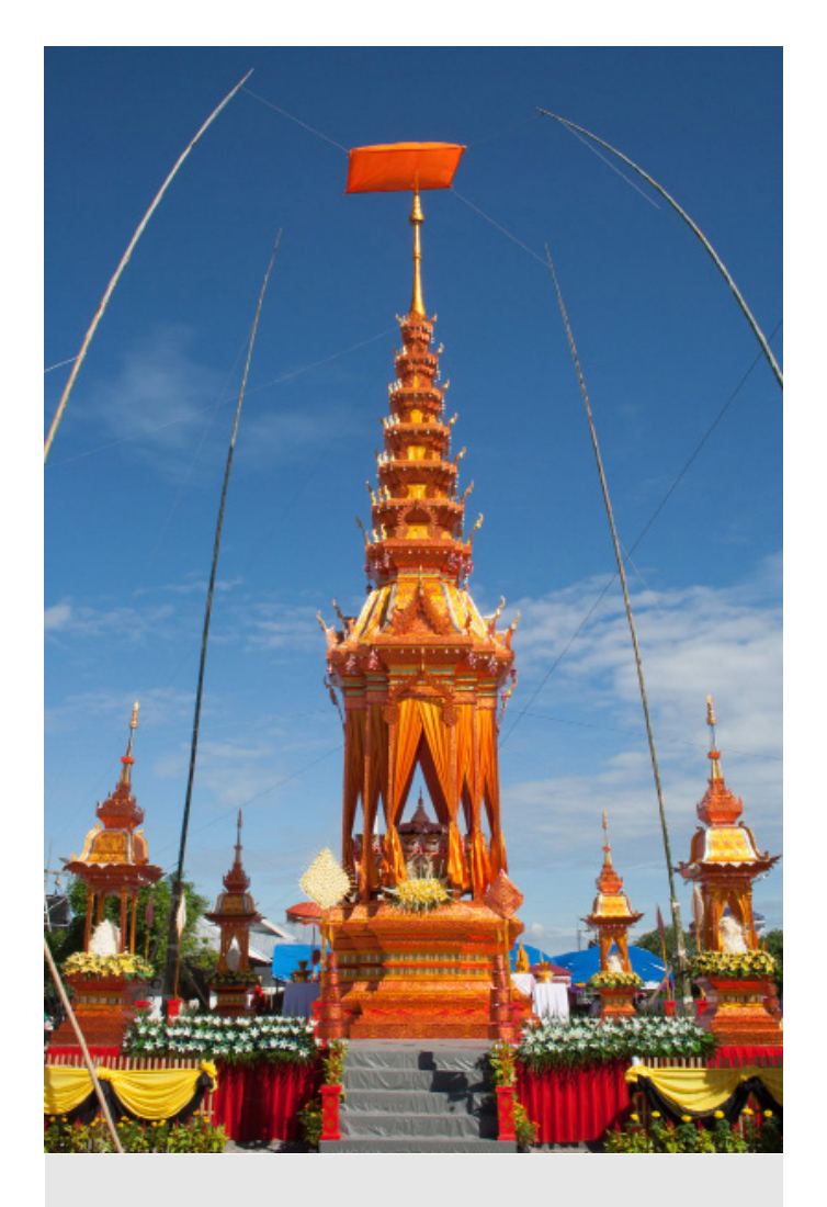
Fig. 1 Prasat sop for high-ranking monk, Saraphi, Chiang Mai Province, Thailand, 2013.

1 Cremation structures serve the utilitarian purpose of incinerating a corpse to aid transition from life to death, but in contemporary practice in Northern Thailand, opulent, golden-colored cremation structures also create a stunning sight that give local viewers a deeper understanding of all sentient beings' connection to death (Fig. 1). The structures, called prasat sop or, literally translated, "corpse palace," are common throughout Northern Thailand, a region culturally distinct from the rest of the country. This essay focuses on prasat sop structures built for Buddhist monks, based on interviews and observations from fieldwork in and around the regional capital of Chiang Mai. In this area, devoted Buddhist monks are accorded high social status due