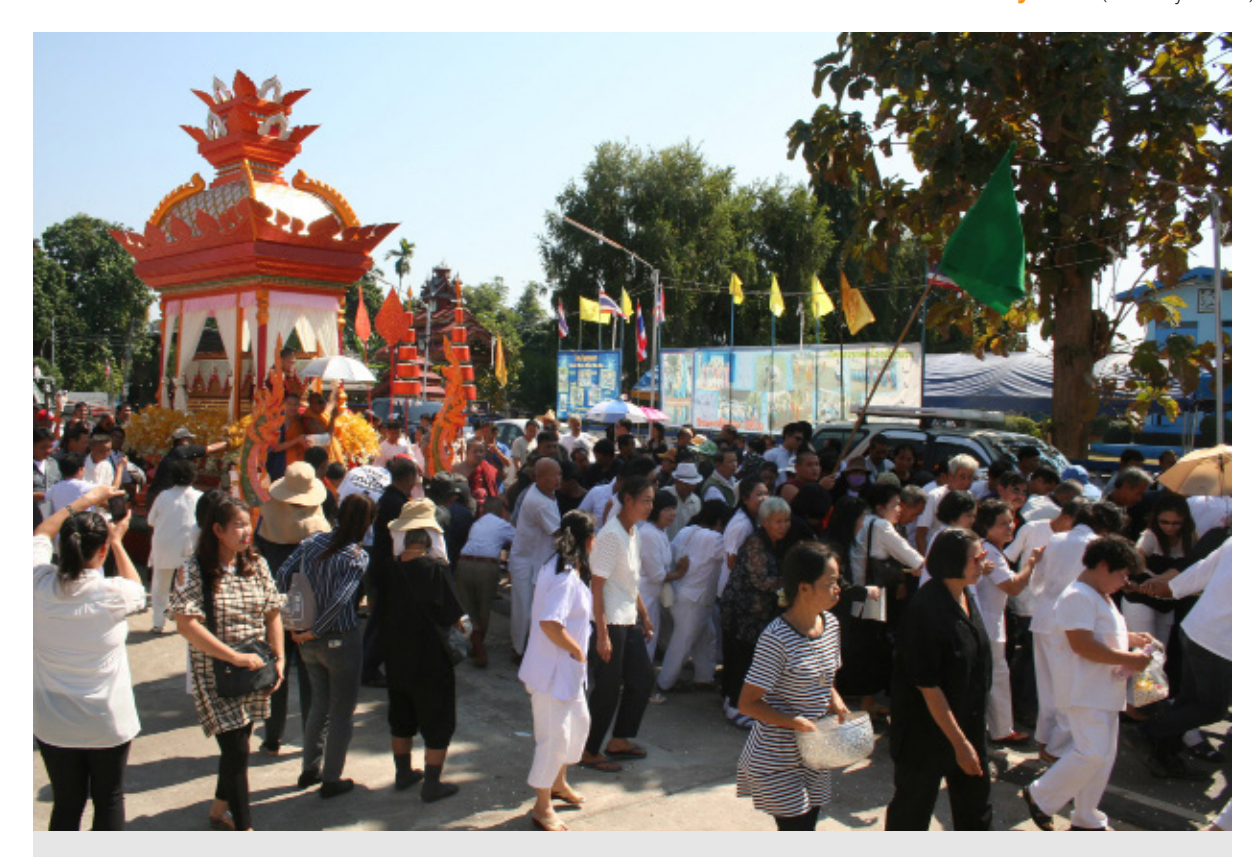
Fig. 7 Funeral procession to deliver corpse to resting place in prasat sop. Wat Kiew Lae Luang, San Pa Tong District, Chiang Mai Province, Thailand, 2016.