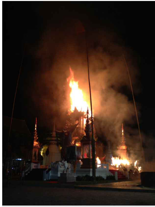
Fig. 8 Burning prasat sop in the cremation fire. Wat Kiew Lae Luang, San Pa Tong District, Chiang Mai Province, Thailand, 2016.