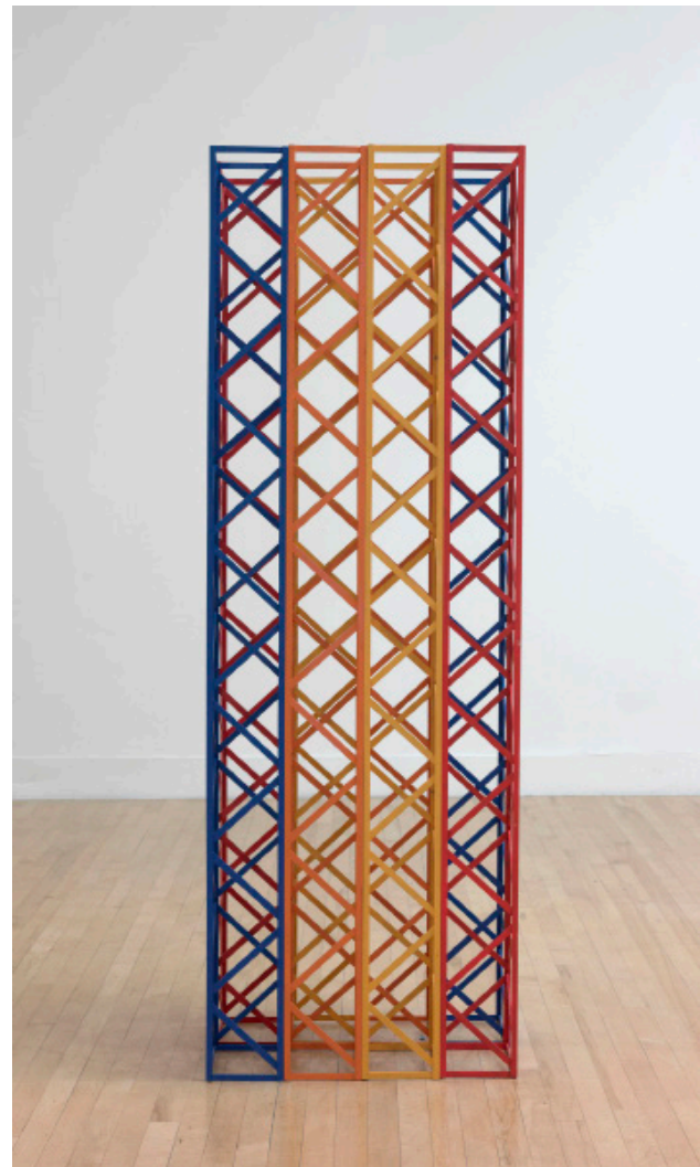
Fig. 2 Rasheed Araeen, Rang Baranga , 1969. Painted wood, 72 x 24 x 181 inches. Presented by Tate Members © Rasheed Araeen.

7 As Bismullah unpacks the discursive constructions and containment of Islamic art, it incorporates another biographical referent situating Araeen's personhood in this history. In 1970, Araeen was surprised to find that the structural works he innovated in the mid-1960s were misrecognized as “Islamic”. 14 The three-dimensional, modular, and symmetrical cubical and lattice forms—such as the free-standing structure Rang