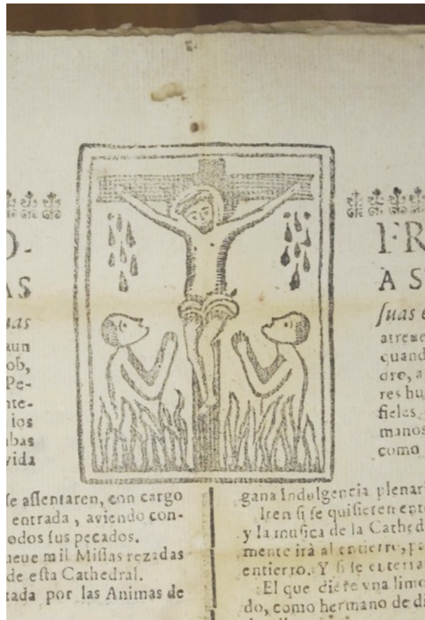
Fig. 1 Detail, membership letter of the confraternity of Souls of the Cathedral of Lima, late-seventeenth-century, Archivo Arzobispal de Lima.