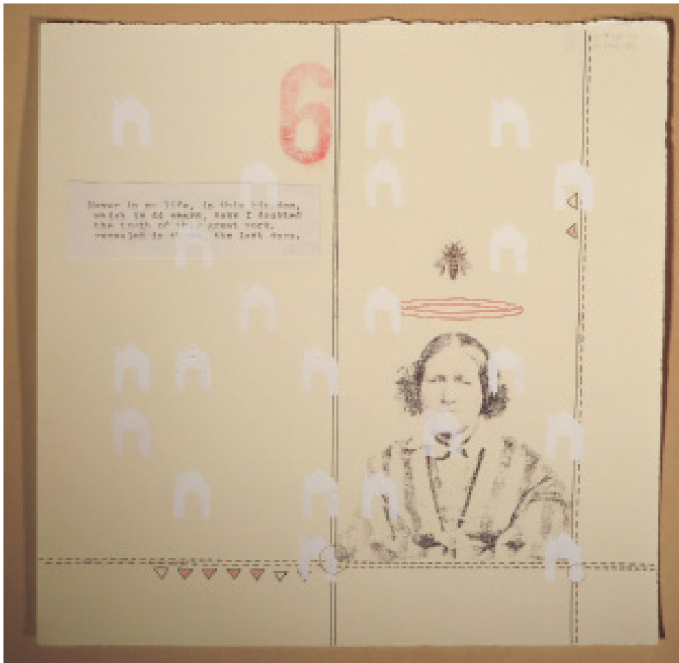
Fig 6 Katie West Payne, Plural Wives of Joseph Smith (6) , 2015.

the number of relocations may have exceeded twenty. He elaborates, “These continual moves must have been a great strain for Presendia, who loved the security of a good home.” 49