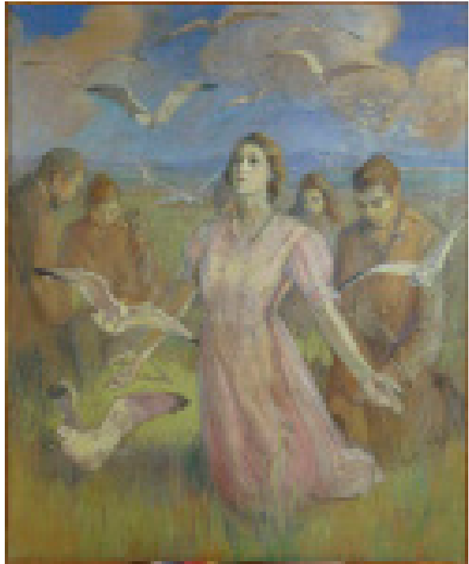
Fig 1 Minerva Teichert, The Miracle of The Gulls , c.1935, oil on canvas, 69 x 57 inches. Brigham Young University Museum of Art, gift of Flora Sundberg, 1936.