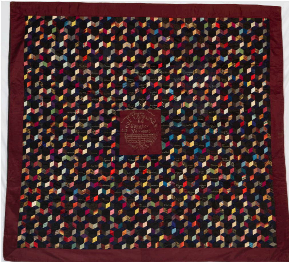
Fig 2 Ogden Women's Anti-Polygamy Quilt, 1882.