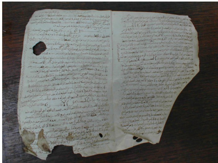
Fig. 2. Fragment of Ibn Abd al-Hakam's Minor Compendium , Kairouan.

The iron-gall ink, now faded to brown, is still quite legible, with twenty-five to thirty-four lines per page. The script is old and angular; in a private communication from May 30, 2020, Humberto Bongianino suggested “its angularity harks back to the script of 9th-century literary papyri from Egypt and is typical of the purest Qayrawānī tradition ( ‘Ifriqī scripts,’ as Ibn Khaldun called them).” There are almost no margins. A few corrections are found interlinearly and in the slim margins; combined with a number of minor transmission errors, these suggest that the manuscript may have been written by a student as part of a course of instruction. They also offer our first clue as to the identity of the text.