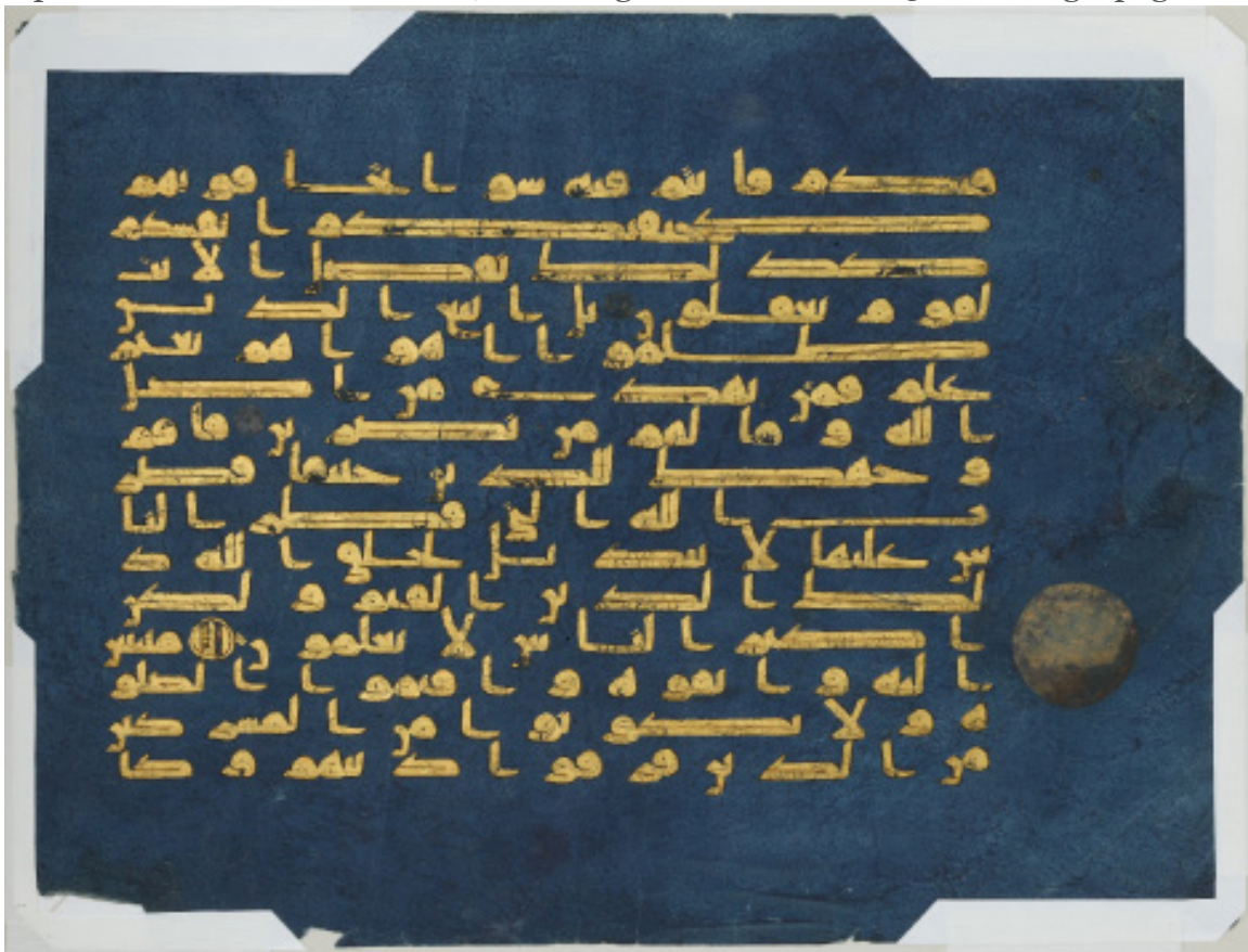
Fig. 6. Blue Qur'an, this folio in the Metropolitan Museum of Art.

In his description, Bayram is most taken with these Qur'ans, many of which are stunning examples of Muslim devotional art, including the famous Blue Qur'an. Single pages of