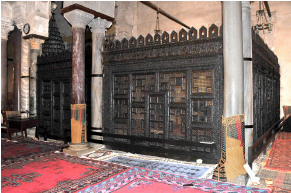
Fig. 5. The Maqsura. By Tab59 - Flickr: Grande Mosquée de Kairouan, CC BY-SA 2.0.