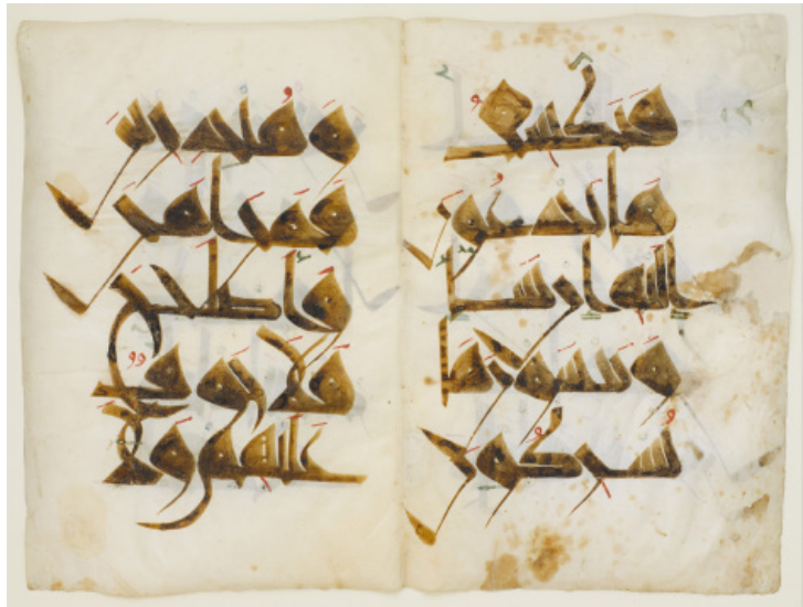
Fig. 4. Qur'an of the Nurse. Metropolitan Museum of Art.

roads from Sousse on Tunisia's Mediterranean coast. The rolling plains are lush with wheat fields and olive groves in winter, dry and dusty in the summer. This was the same route that local dignitary Muhammad Bek Bayram VI used when he traveled to Kairouan in 1896 by horse-drawn tram. Bayram was a scion of a cultured family who kept up with