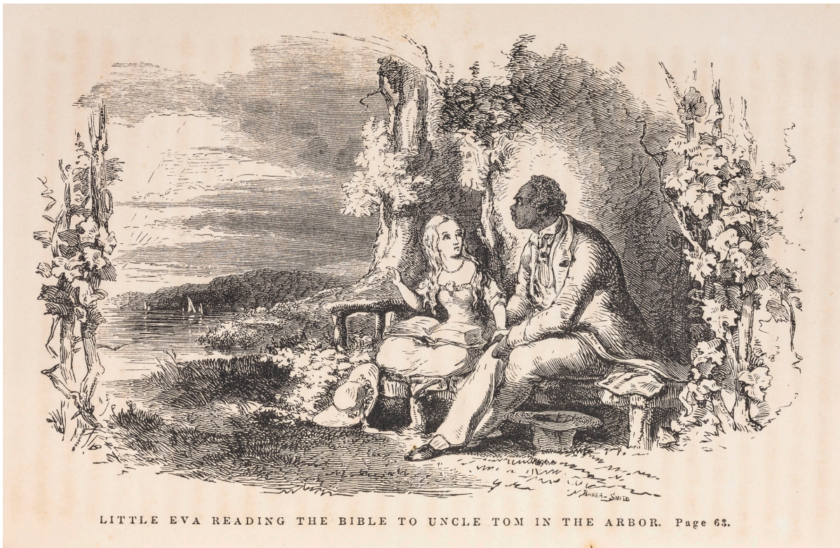
Fig. 3 “Little Eva reading the Bible to Uncle Tom in the Arbor” in Harriet Beecher Stowe, Uncle Tom's Cabin; or, Life Among the Lowly (Boston: John P. Jewett and Company, 1852) 2: 63. Set Broadside.

Placed within the books, and therefore viewed within their material confines, the sizes and positions of the visual images offered material and sensory experiences for viewer-readers. The publisher had “Little Eva Reading the Bible to Uncle Tom in the Arbor” set after a blank page. The image was turned and set broadside. Reader-viewers first had their gaze and reading flow disrupted by the blank page. Then, to view the image properly, they had to physically turn the book ninety degrees. This compelled specific attention to the scene. To see the image, viewer-readers also had to hold it close. For some whites who may have interacted rarely, if ever, with African Americans or slaves in person, they now beheld and held an intimate scene in an intimate way. Viewer-readers mimicked the behavior of Tom and Eva: they held books. Due to the placing and the size of the image, the book drew viewer-readers close to this religious and interracial moment. They too had the opportunity to experience peace and calm amid the troubles of the era. 38