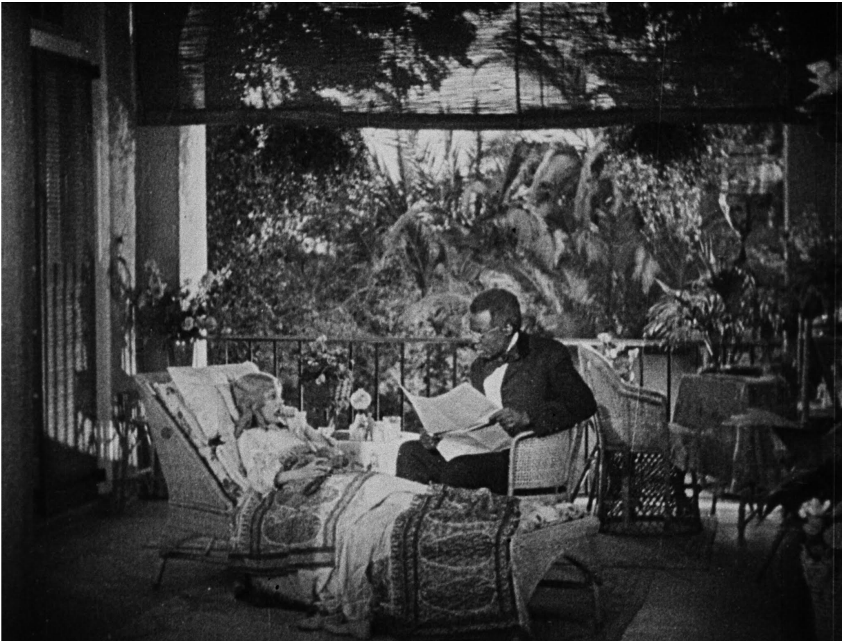
Fig. 7 Photographic still from cinematic version. Harry A. Pollard, director, Uncle Tom's Cabin (1927).

By emphasizing Tom’s possession of the book and his religious directing of Eva, the cinematic version made Tom the central signifier of religion. The film added another example of the “burden of black religion” whereby religiosity was seen as innately part of African Americans’ personalities and beings. 67 Also, in an era where D. W. Griffith’s Birth of a Nation (1915) presented African American men as contemptible villains who wished to prey sexually upon white women, the scene from Uncle Tom’s Cabin posed interracialism as plantation nostalgia that assumed and taught that life was better when blacks were slaves and whites were masters. In the cinematic version, Uncle Tom became like Uncle Remus—an older black man who regaled young whites with stories and mythologies. 68