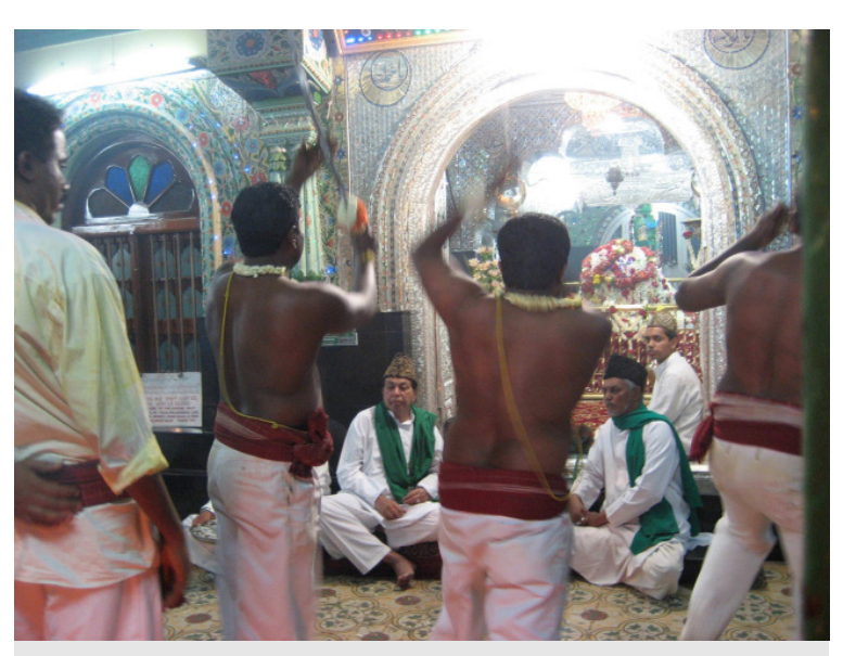
Fig. 11 The veer kumars performing their protective postures before the mujawwars of the dargah

16 As the Karaga leaves the Sri Dharmaraya Swamy temple at midnight, at Hazrat Tawakkal Mastan, flowers cover the tomb, filling the air with the fragrance of jasmine. People begin to arrive in the courtyard in early afternoon to secure a spot from which to best view the visit of the goddess to the tomb. By two in the morning there is nowhere to sit and barely space to breath as the veer kumars come through in a steadily increasing stream in advance of the Karaga itself. Around 3 am the chief mujawwar arrives and, along with the most senior men connected to the dargah, takes up position at the