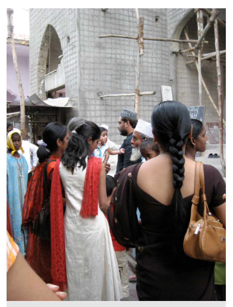
Fig. 2 Namazis blowing prayer-purified breath over children brought by their families for healing

<sup>9</sup> Some namazis blow softly on the children, sometimes touching them and praying silently or quietly, sometimes simply blowing and moving on. It is a simple act, and one that not every namazi does, but many do take time to stop and offer this comfort to concerned parents. This is not uncommon at mosques in South Asia, where different congregations are known for helping with various problems. The breath of the Tawakkal Mastan mosque namazis reputedly relieves nightmares and other common childhood disorders like diarrhea or bed-wetting. The participants (both the namazis and those who await them) report that the power of healing is in the breath made pure by their recent prayers. These encounters resonate with practices elsewhere in India, such as the Hyderabadi healer Amma with whom Joyce Flueckiger worked for years. Amma was frequently solicited for her healing breath by a religiously mixed clientele. After reciting verses from the Qur'an (also a necessary part of namaz), she would blow directly onto a supplicant or onto water or rice to be consumed as a blessing elsewhere.<sup>38</sup> Though people may seek out those seen as particularly pious or understood to be religious professionals, such as Amma, to obtain their presumably powerful breath, laywomen