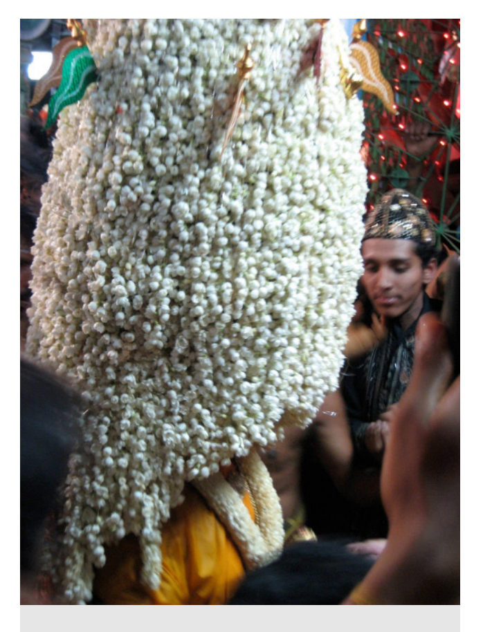
Fig. 6 The Karaga procession leaves the dargah

24 with oneself, one's community, and one's god (or goddess). For example, the priest who both carries and becomes the vessel of the goddess is required to reorient all of his relationships. He removes himself from his family for six months and goes into training at the temple guided by fellow priests. He is also viewed and interacted with differently by the Hindu men of all ages who vow to protect the goddess as veer kumars (brave sons) during the procession (Karaga Shaktiotsava) of the Karaga, and to kill the priest should he fail to maintain the integrity of the goddess's dance. Unusually,