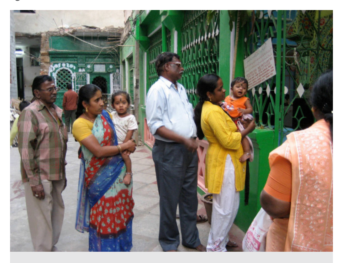
Fig. 1 Hindu families await those praying in the mosque to emerge and bless their children (All photos by the author, 2001).

Of the three examples of embodied practice centered at Hazrat Tawakkal Mastan's 8 dargah, the first is the most quotidian. This is an engagement of breath, an encounter between Muslim men and a largely non-Muslim clientele requiring the mutual recognition of those in need of help and those believed to be (and believing themselves to be) in a position to help. Next to the tomb is a mosque. After each of the five daily namaz prayers, but mostly in the afternoons and evenings, Hindu families line up with their children outside the mosque. The men leaving after prayer ( namazis ) are confronted as they exit by a line of people in need, standing between the mosque and the tomb, expecting them to blow their breath as a prayer (du'ā' phunkna) over their children. These are not religious professionals, associated with the mosque or the tomb shrine, but average attendants at namaz who are recognized as sources of power by the other denizens of the spaces. Namaz involves recitation of formulaic prayers accompanied by bodily motions, repetition of passages from the Qur'an, and personal supplicatory prayers (du'\bar{a}') —all activated through proper intention ( niuuat ) and a conscious turn of focus towards God. As the medieval scholar Abū Hamīd al-Ghazāli (d. 1111) put it, "Action without a true intention is show and pretense; it is a cause for rejection, not closeness [to God]."37