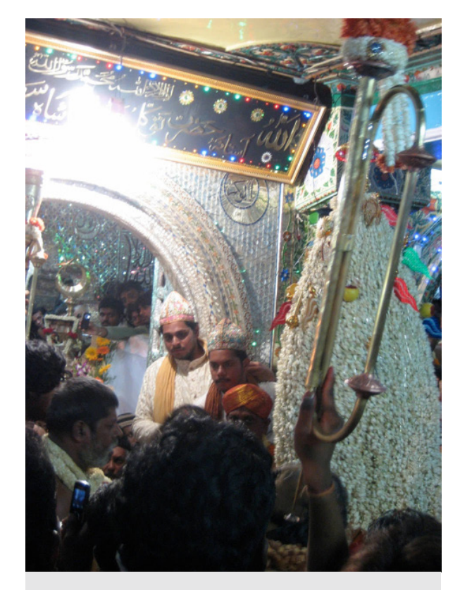
Fig. 13 The Karaga circumambulates the tomb

<sup>17</sup> Hundreds of veer kumars precede the karaga carrier, performing their fire offerings and chest striking in front of the tomb as they do at other points on the route—temples, tanks, and other invited stops. Eventually, the karaga itself arrives and circumambulates the tomb three times. After the third circuit, the karaga carrier pauses in front of the tomb and its custodians who are awaiting this moment. Several attendant priests give lemons to the karaga carrier and the chief mujawwar likewise has several lemons in