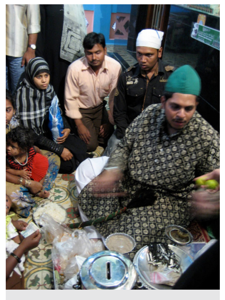
Fig. 5 Making amulets