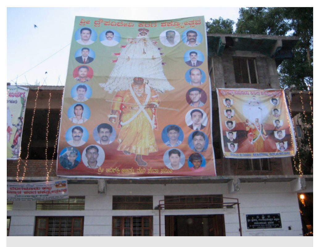
Fig. 8 Signs anticipating the 2009 Karaga festival