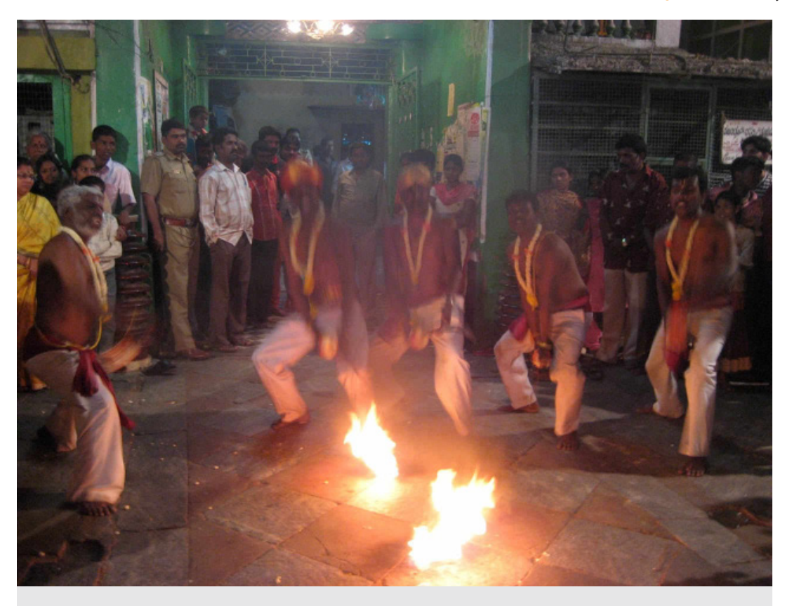
Fig. 10 The veer kumars performing their protective postures in the courtyard of the dargah

16 As the Karaga leaves the Sri Dharmaraya Swamy temple at midnight, at Hazrat Tawakkal Mastan, flowers cover the tomb, filling the air with the fragrance of jasmine. People begin to arrive in the courtyard in early afternoon to secure a spot from which to best view the visit of the goddess to the tomb. By two in the morning there is nowhere to sit and barely space to breath as the veer kumars come through in a steadily increasing stream in advance of the Karaga itself. Around 3 am the chief mujawwar arrives and, along with the most senior men connected to the dargah, takes up position at the