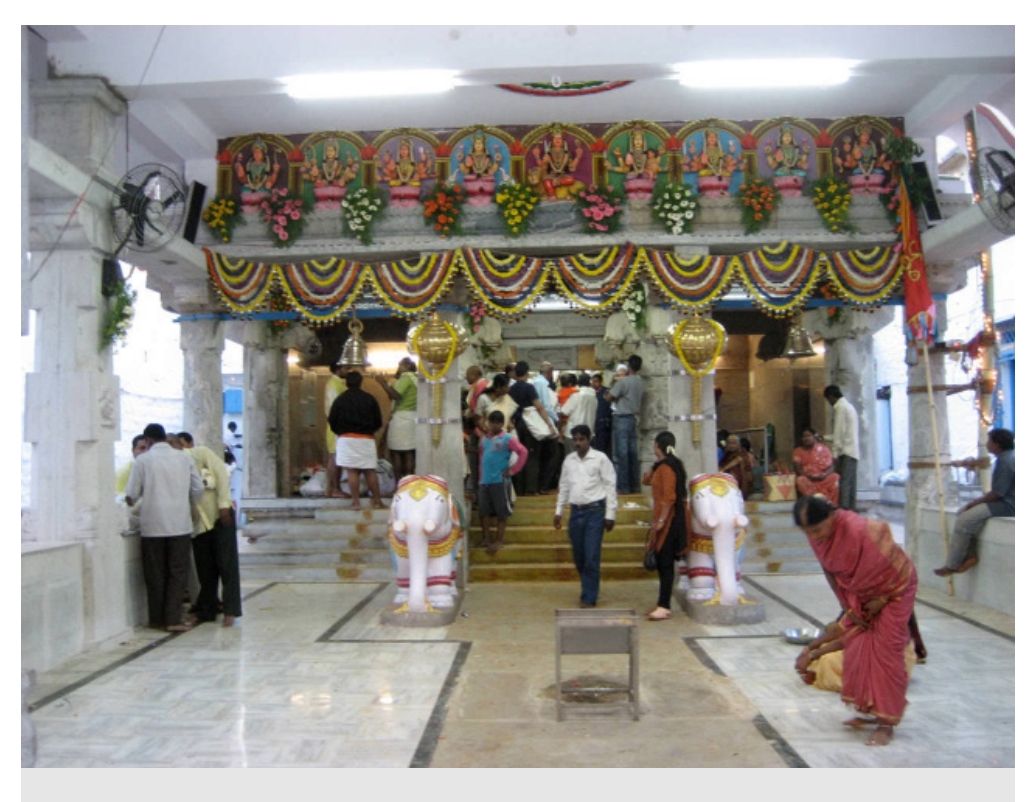
Fig. 7 The Sri Dharmaraya Temple in preparation for the Karaga festival (2009)