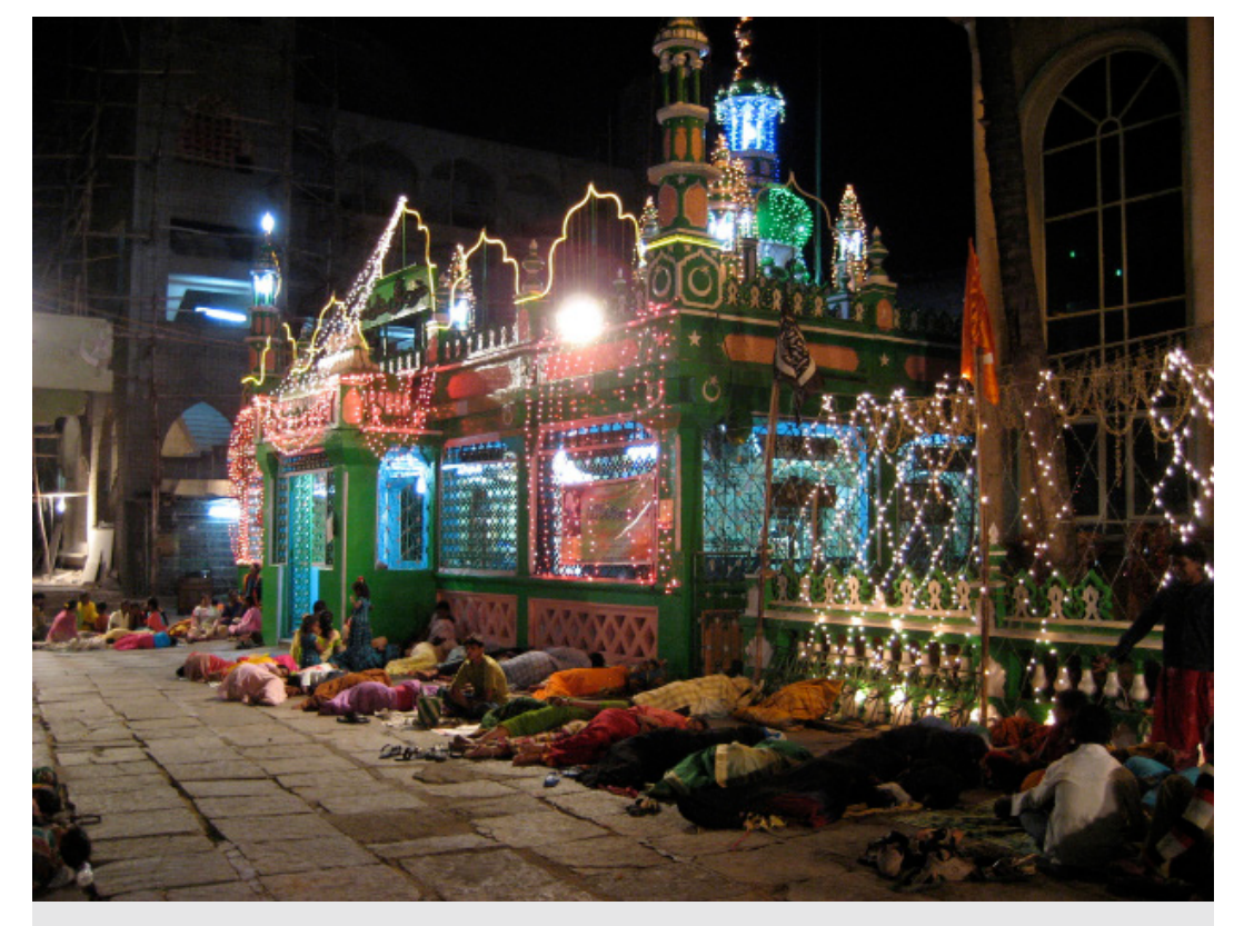
Fig. 9 The evening before the Karaga procession, the waiting begins at Hazrat Tawakkal Mastan