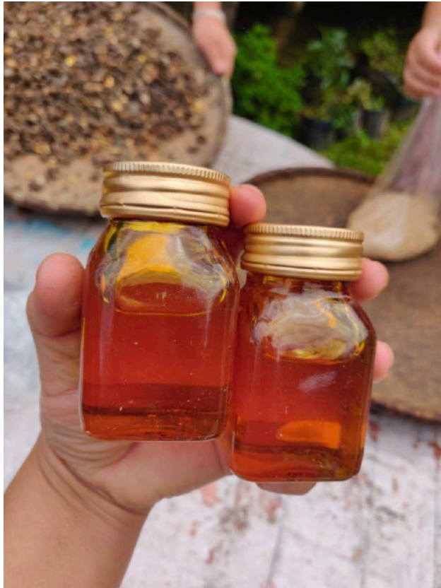
Figure 8. Honey for inclusion in the ingredients of the Riwo Sangchö , 2020.

Cantwell has argued that assuming rituals related to the environment are environmentally friendly is problematic in the Tibetan context, as these rituals do not actually have a physical outcome. 41 Similarly, the idea of sang as reciprocal in its benefits appears questionable, since preparation involves cutting off branches of healthy trees and the use of other environmental materials. However, in a west Sikkim context, the preparation of sang does bring environmental benefits. As a child when my family prepared sang offerings, my parents stressed the importance of gathering the materials with careful intention. My siblings and neighbors have continued to transmit this message to their children. For example, only the required amount of any tree branch or plant should be taken; and if there was only a small amount left, it was preferable not to remove it, but instead look elsewhere for other materials. For the trees, such as juniper and pine, it was important to check that their bark and leaves were healthy before removing cuttings of branches for the offering, and to not take too much. Additionally, removing cuttings of branches for sang is seen as beneficial to the tree, as cutting promotes regrowth and continued health. Tree materials can only be burnt on sang a day after they have been gathered in order to allow insects to leave the branches so they will not be harmed. In this way, sang is practiced as part of a system of local forest management.