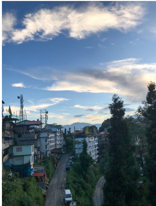
Figure 13. The concrete hotel landscape of Pelling, 2020.

In the early to mid-twentieth century, west Sikkim became known for its agricultural abundance and, since tourist permits to the border state were hard to come by, only a small group of trekkers and guests of Gangtok elite ventured westward. This changed after Sikkim was absorbed into the Indian Union in 1975. In 1990, the state eased