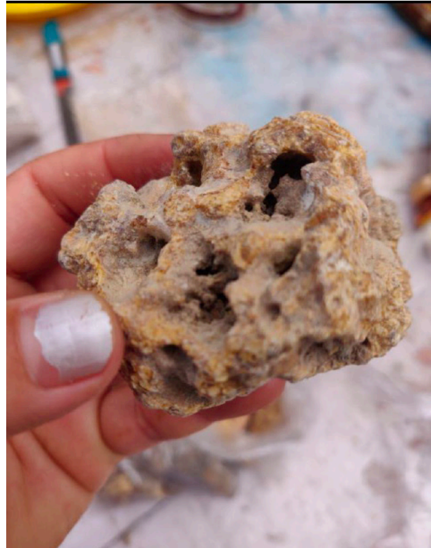
Figure 7. Copal resin for inclusion in the ingredients of the Riwo Sangchö , 2020.

The Denjong Nesol's description of the pine tree as “the king of trees” is especially salient since pine trees are present throughout Sikkim. 40 Though the borders of the state have changed over time since Lhatsun’s visit in the seventeenth century, when he visited he encountered the diverse ecosystem of the state, spanning from the alpine trees around Dzongri where he descended from the mountain pass out of Tibet, down to the subtropical highland climate of west Sikkim. The availability of these and other plants facilitated the popularization of sang offerings, and also shaped what was offered in sang.