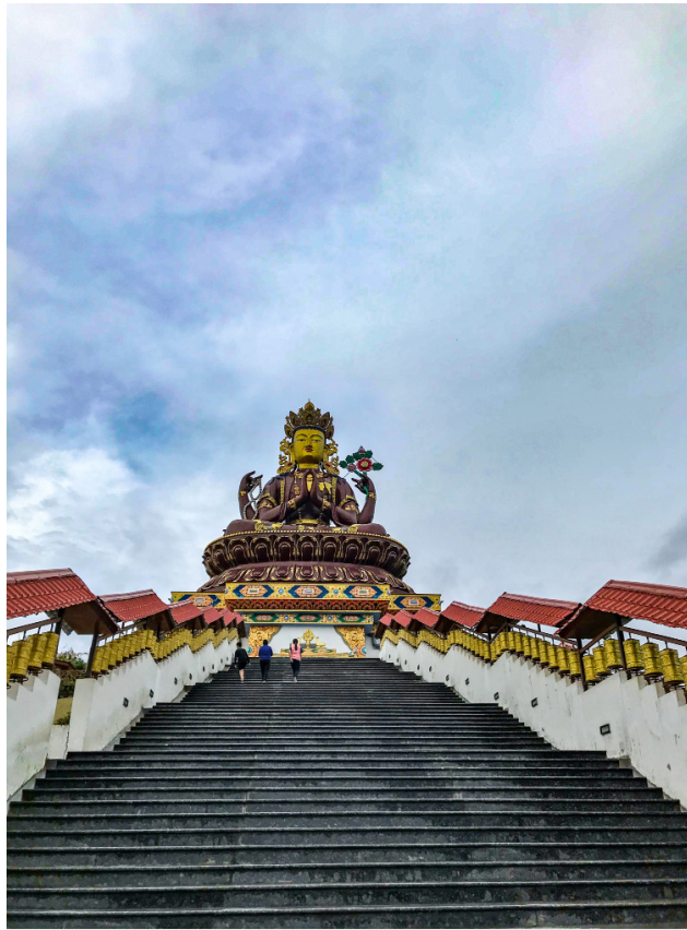
Figure 14. Statue of Avalokitesvara, near Sangha Choeling, Upper Pelling, 2020.

gling ) above Pelling. In that year, a local contractor began road construction up to the important Sangha Choeling meditation center in preparation for a giant statue of the bodhisattva Avalokitesvara to be built there. After some heavy rain, the road that had been dug out collapsed, sending down rocks and mud all the way to the Rimbi river. It narrowly missed Singyang village. Distraught local community members again went and requested advice from Yangthang Rinpoche; he instructed them to conduct a large Riwo Sangchö ritual to apologize to the spirits resident in the Dorje Phagmo Lhakhang at the monastery, who were angry because of the use of dynamite in the road construction. The rituals went on for three days and after that, despite the challenging terrain, the road was eventually completed. In 2018, the Avalokitesvara statue was opened to the public—following a presentation of Riwo Sangchö , of course.