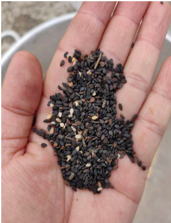
Figure 9. Black sesame seeds for inclusion in the ingredients of the Riwo Sangchö , 2020.