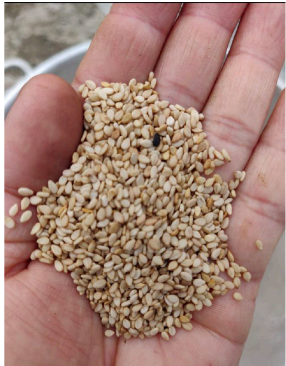
Figure 10. White sesame seeds for inclusion in the ingredients of the Riwo Sangchö , 2020.