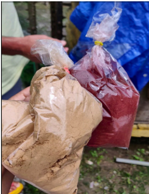
Figure 11. Ground white sandalwood and red sandalwood for inclusion in the ingredients of the Riwo Sangchö , 2020.