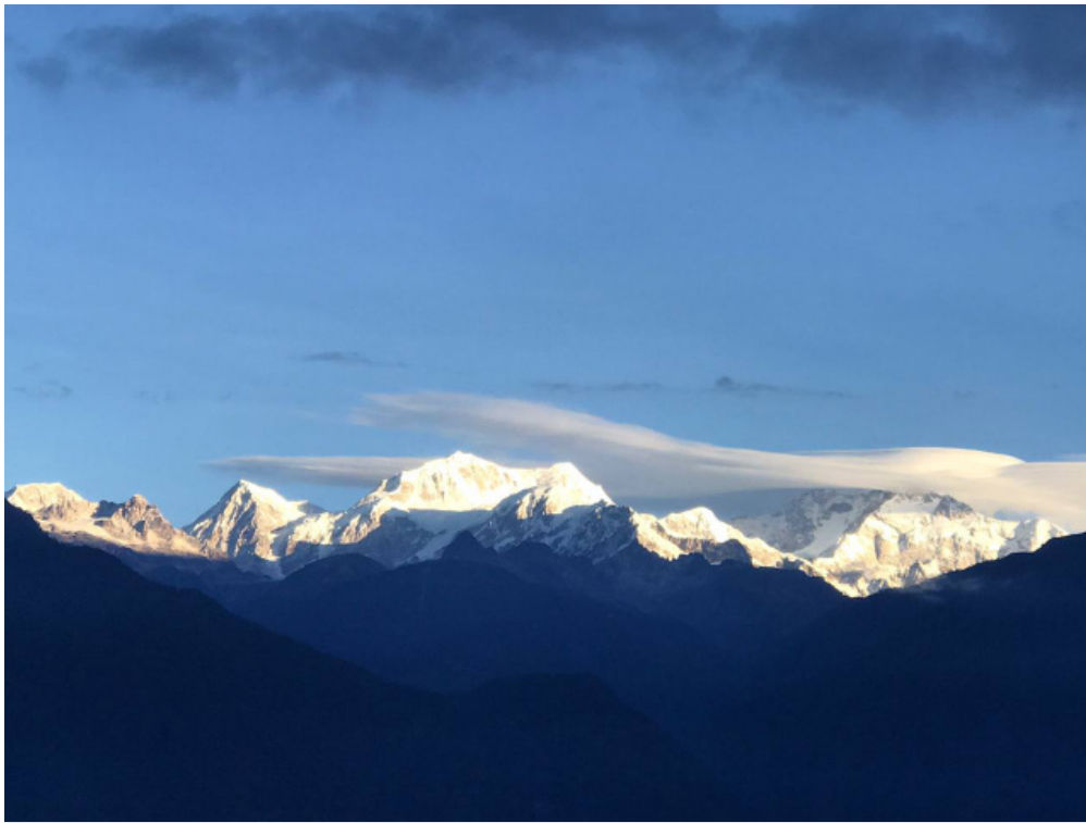
Figure 5. Kanchendzonga, 2020.

How fortunate and gratifying that the keeper of the Hidden Land, there was a keeper of the Hidden Land, How fortunate and gratifying that the keeper of the Hidden Land was Tekong Salang, that keeper of the Hidden Land . . . 37