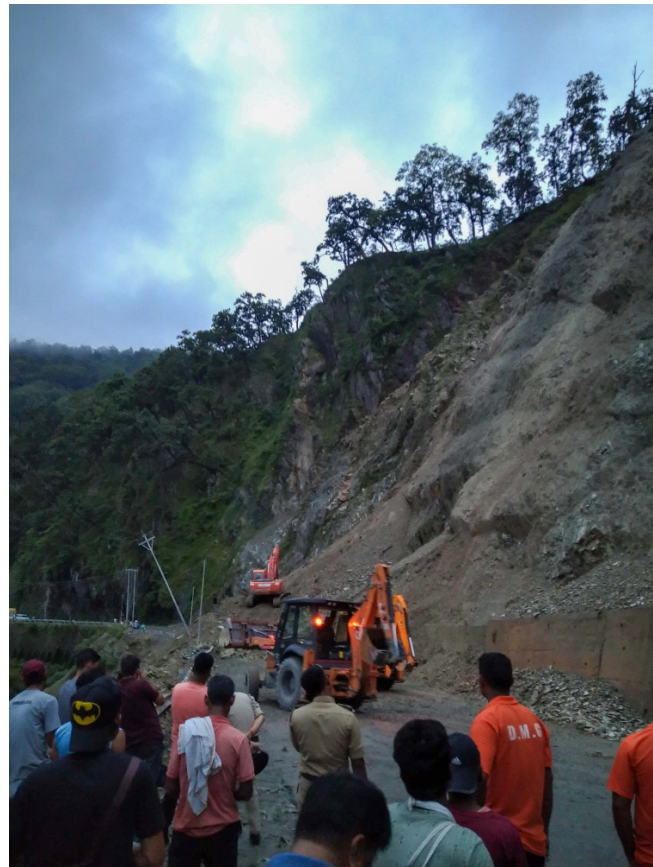
Figure 2. Image of landslides in Sikkim, 2020.