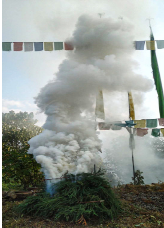
Figure 3. A Riwo Sangchö ritual underway, west Sikkim, 2020.

At the beginning, the lama, or ritual officiant presiding over the Riwo Sangchö will recite the refuge and lineage prayer of Lhatsun. 25 He or she will then invoke “om ah hum” three times and sprinkle purifying water on the fire, which can also serve to calm the flames. Once the fire has burned into charcoal, the sang materials are added, starting with green juniper which is cut and added to the charcoal. Other ingredients such as the three whites and three sweets (discussed above) are slowly added until the smoke begins to billow out of the fire. The sang has a strong smell. It makes the eyes of the residing lama and the people in attendance prickle, and sometimes even leads to sneezing or coughing. The lama then begins the prayer, standing or sitting near to the fire but not so close that the smoke prevents them from reading their text. Some lamas will do a simple recitation of the prayer; others will accompany their prayer with a bell