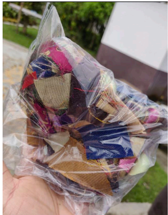
Figure 12. Silk and other precious textiles for inclusion in the ingredients of the Riwo Sangchö , 2020.