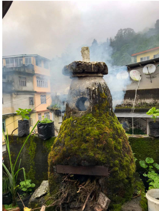
Figure 4. A Riwo Sangchö ritual underway in a sangbun on top of a residence, west Sikkim, 2020.

However, this interpretation does not consider the history behind this practice, including the time, place, and context in which this specific sang ritual arose. Taking these factors into account inspires a broader understanding of why this ritual was seen as efficacious in 2003 as a response to the Gezing landslide, and why it continues to be widely practiced. The colophon at the end of the text as it