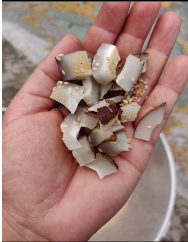
Figure 6. Chopped up coconut for inclusion in the ingredients of the Riwo Sangchö , 2020.