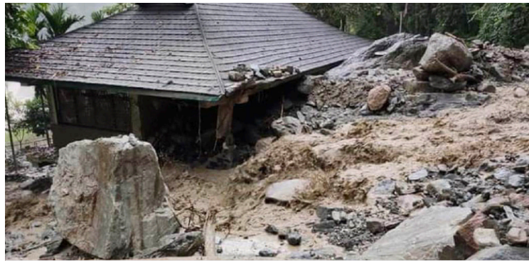
Figure 1. Image of landslides in Sikkim, 2020.

In 2003, an enormous landslide between Gezing and Pelling, two urban centers in west Sikkim, cut the major state highway between the West District and the capital for days. Houses were destroyed, a number of their inhabitants hospitalized, and power and water supply was cut off. Food and rations supplied from the Indian border town of Siliguri were delayed, and deliveries to nearby villages dependent on Gezing market paused. Local Buddhist communities did not see this only as a symbol of state negligence and apathy towards road maintenance, which it was, but also considered the broader reasons behind the disaster. 1