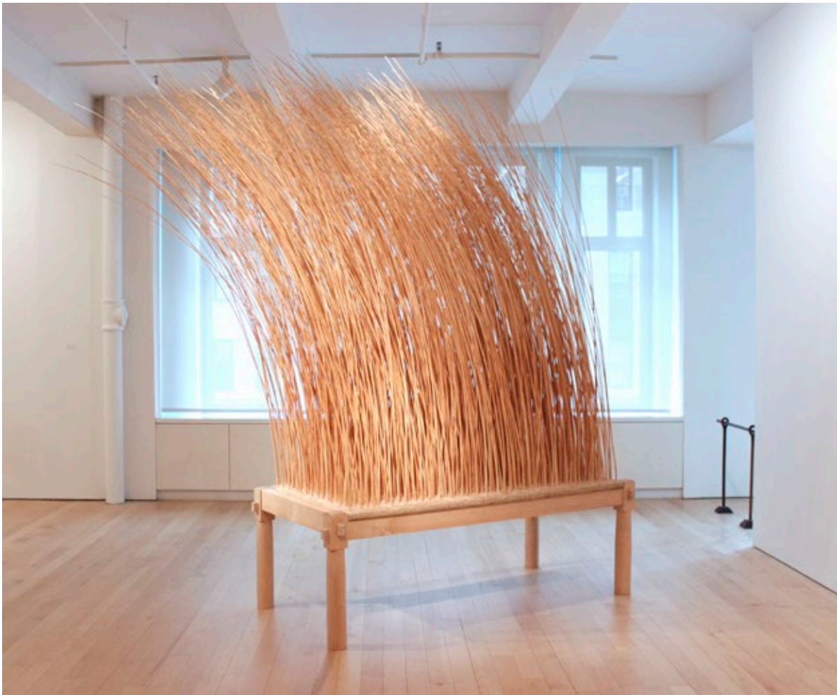
Martin Puryear, Night Watch , 2011

yearning , an exploration of breaches and of striving towards unfulfilled promises, we begin to understand the complicated ways that Puryear's art revolves, like that wheel, around questions of justice and salvation. Desire affirms both the pleasures and the pains of history understood dialectically: the need to march towards goals forever at a distance. It is about sin as separation. And Selma.