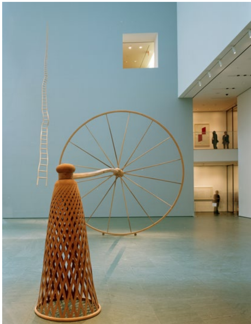
Martin Puryear, Desire , alternate view

Given the sculpture's title, it is hard to discuss the piece without becoming entangled in double-entendres. In thinking of desire , are we discussing wood or sexuality? Is the work's tactility a reference to the traditions of sculpture or the attractiveness of the body? Is "desire" a term of relation between human subjects or a larger and more abstracted description of the dialectic between wheel and basket? Before answering, we need to bear in mind not just the two quasi-independent objects at either end of Puryear's piece, but the long wooden tether that unites them. In what way does that tether function as the key to the object's power? Perhaps this is not a sculpture about wheels and baskets but about distance : the separation that keeps two objects in perpetual relation to each other and in a state of recurrent desire .