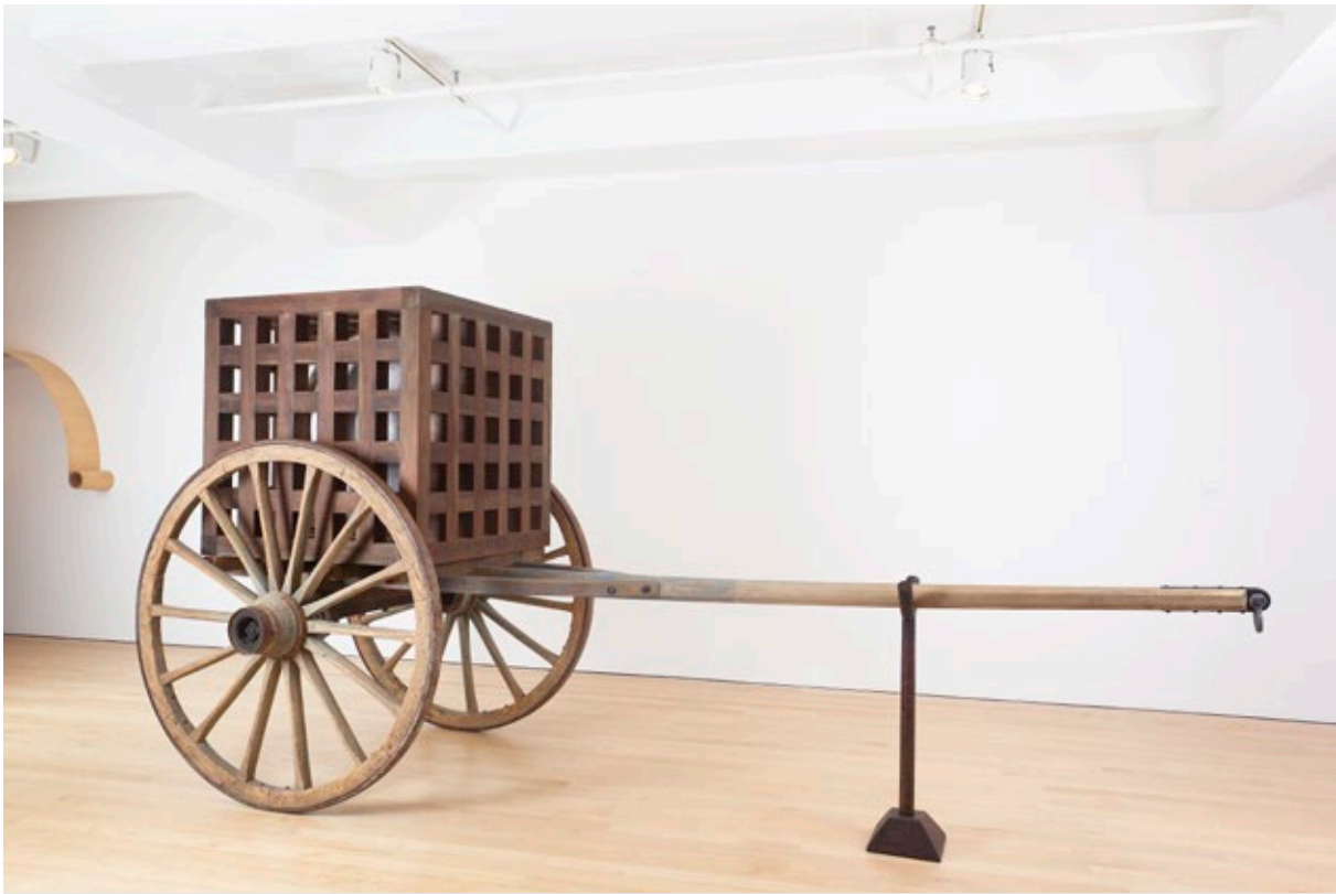
Martin Puryear, The Load , 2012

That basket at the center of Desire embodies in its elegant form four hundred years of African American experience.