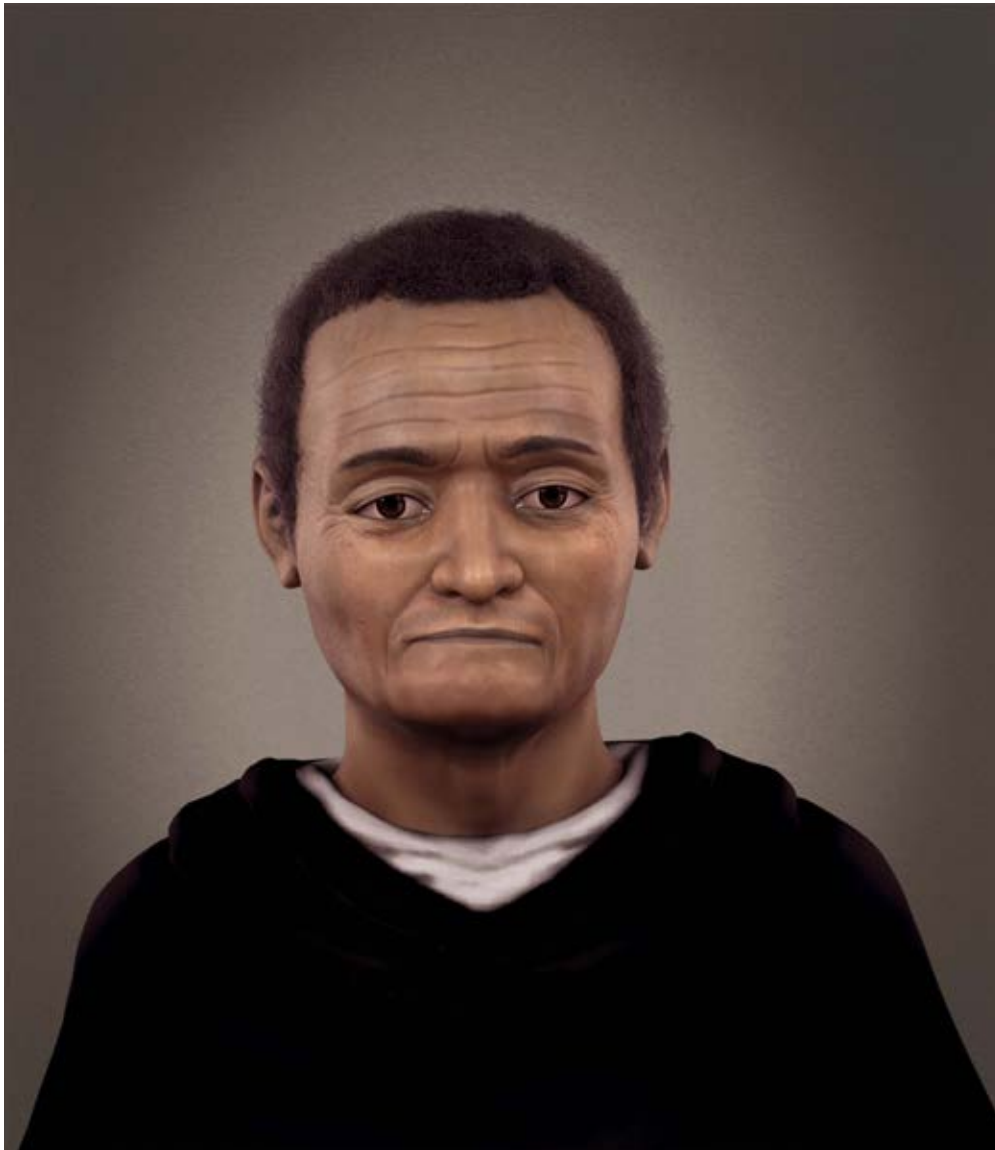
Facial Reconstruction of Saint Martin de Porres

[it means] we are all called to sainthood. We don't necessarily have to be spectacularly beautiful. We are all called to sainthood.