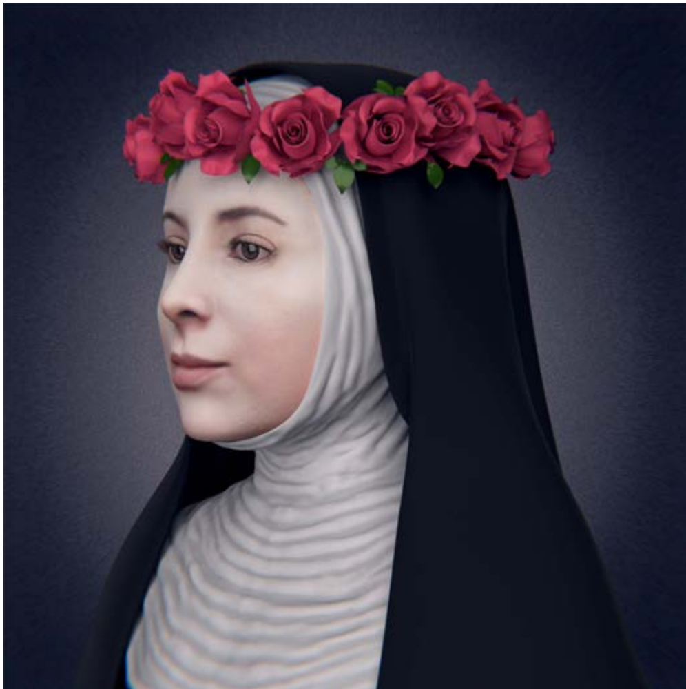
Facial Reconstruction of Saint Rose of Lima