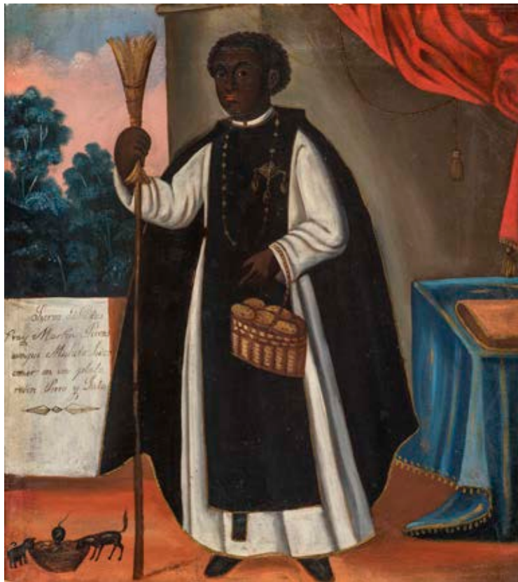
Saint Martin de Porres, oil on canvas, 19th century, Barbosa-Stern Collection, Lima

So we accepted the proposal, which is within our right to do so because the relics are the property of our order here in Peru. We made the agreement. The University of San Martín de Porres, Lima participated with the facial CT-scanner from their hospital or university clinic. We delivered the skulls with all the security in the world. The police came, the army, and everyone else, because after all these are also human skulls, they are human remains, not just relics, and there was a lot of television and that kind of thing.