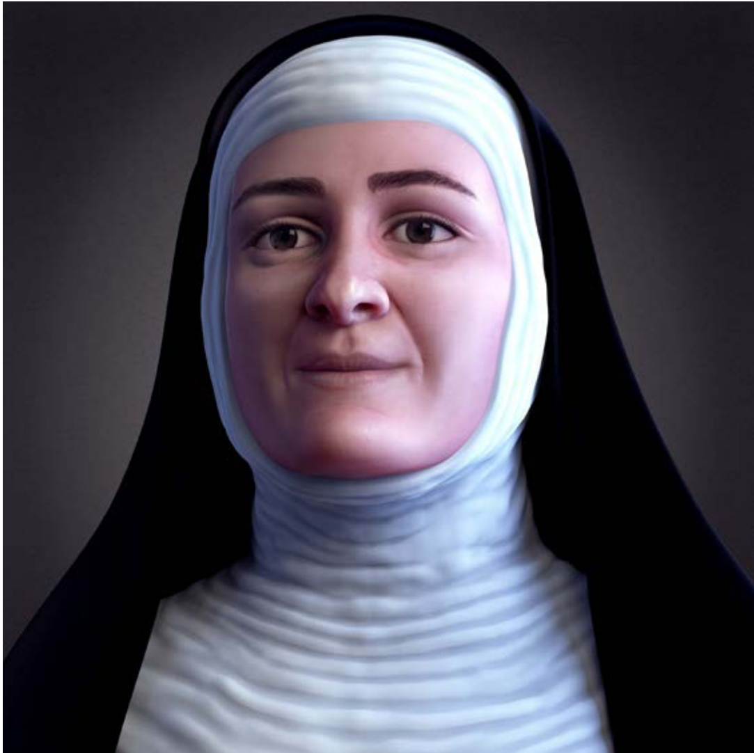
Facial Reconstruction of Blessed Ana de los Ángeles

Blessed Ana de los Ángeles could also be done. They were interested in doing it and so they also have the true face of the Blessed Ana.