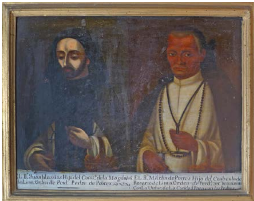
Double Portrait of Saint John Macías and Saint Martin of Porres, 17th century