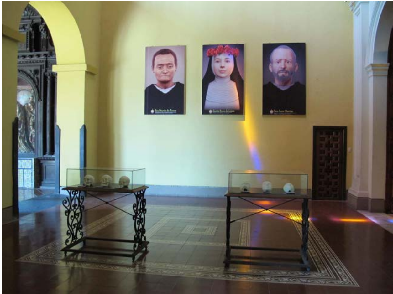
Display of the Facial Reconstructions of the Peruvian Saints at Santo Domingo, Lima

Saint John Macías (1585-1645) was born in Extremadura in Spain and immigrated to Peru where he entered the Dominican Order as a lay brother. Like Saints Rose and Martin he was known for his humility. Saint John and Saint Martin were close friends in life. Saint John was beatified in 1813 and canonized in 1975.