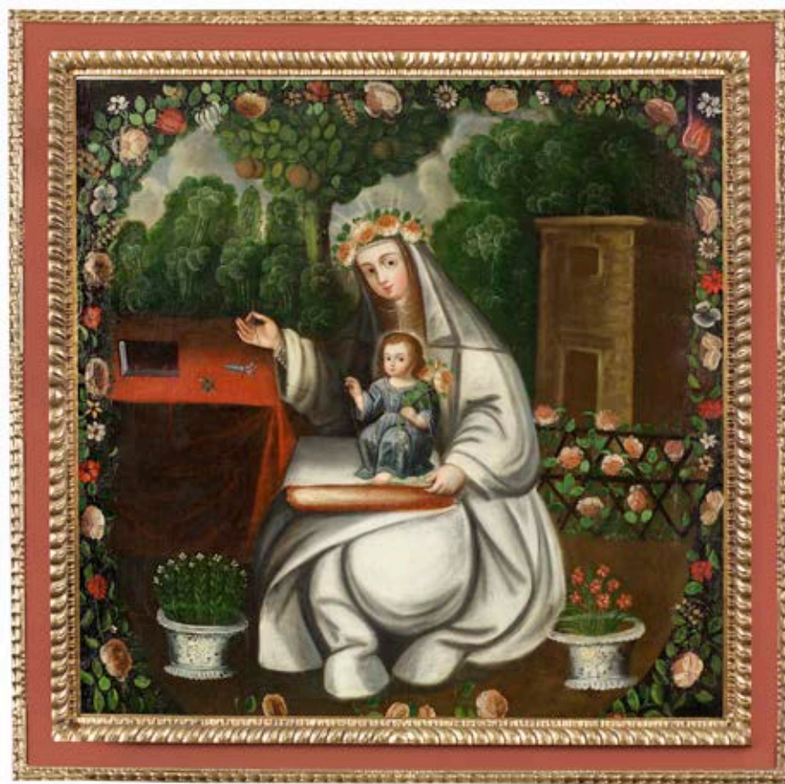
Cuzco school painting of Saint Rose of Lima, 18th century, Barbosa-Stern Collection, Lima

I consulted with the community chapter, we asked for permission from the Dominican province and they said yes, because we after all in some ways already have an antecedent [for doing this] and furthermore we had quite a curiosity to know how they looked as we've always had images of Saint Martin, of Rose, and of John that were very stylized. Saint Martin sometimes looks either too African or very little African but with dark hair. There is a truly wide range. Regarding Saint John Macías we had no idea. And of Saint Rose what are most familiar are her representations in Cuzco School paintings, whereas for Martin and John there basically aren't very many Cuzco School paintings. 1 I can think of a couple of works and nothing more.