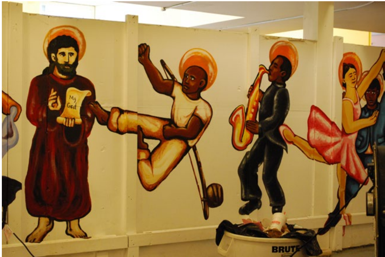
Detail of the Dance with the Saints mural, showing the capoeira dancer