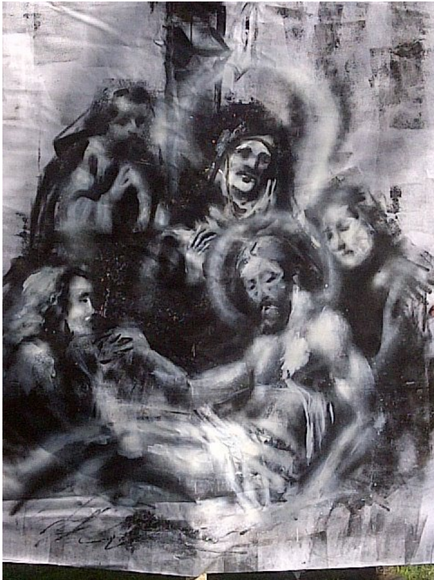
Katro Storm, Stations of the Cross

were almost a little curious to find out, “So what is it that [appealed so much to others]?” It sparked conversation.