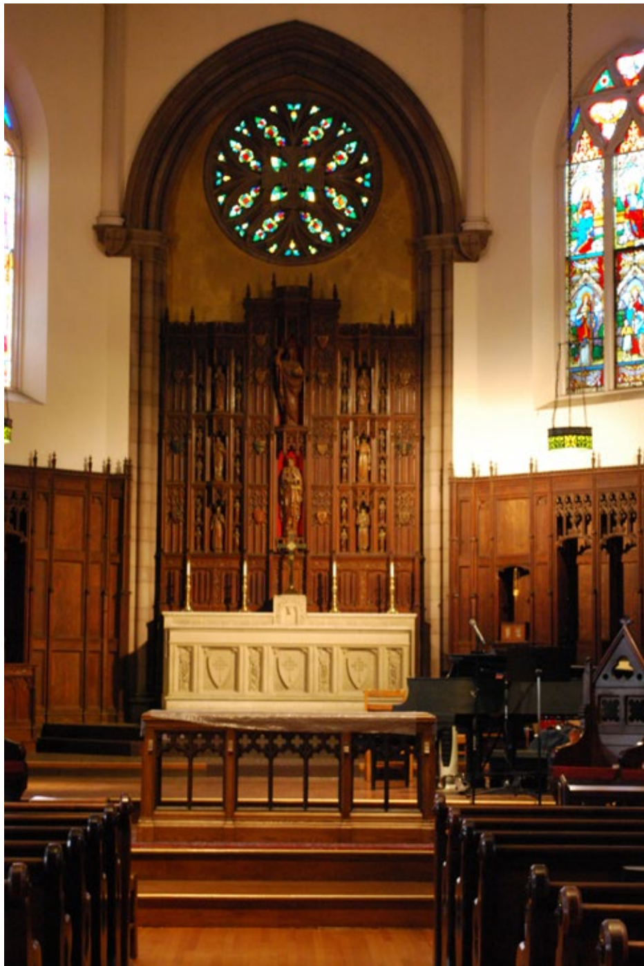
View of the reredos at St. Paul and St. James

great pride in our buildings as worship space. We set a sense of the holiness: that it is something different that you're walking into. Physical space is important to us. If you want to find that out, just try messing with stuff. Try moving some furniture around and you'll see just how important it is. I think it's crucial to who we are as Episcopalians.